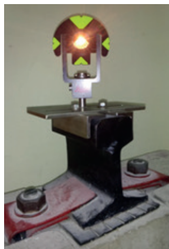
Fig. 1. Clamp with central point and mini prism

method described in [6, 11] to solve the problem in the local 3D reference system. The estimation method used to calculate the rectification corrections for crane rail axes is the parametric method with conditions imposed on parameters (for instance [3, 19, 20]). The quoted references analyse in detail the issue of calculating corrections for crane rail axes in 3D, and include simulated real cases referring to different types of overhead cranes. Since calculating corrections is not the main subject of this paper, only basic assumptions of this method are presented here.