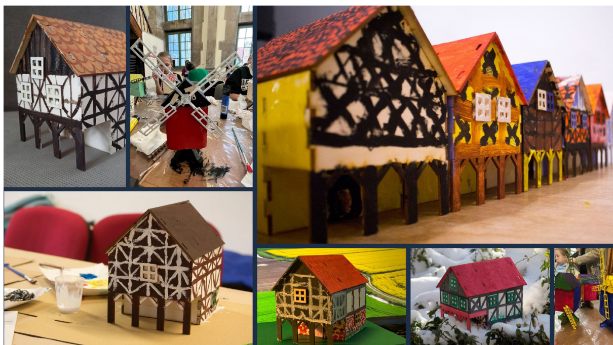
Fig. 4. Final results of the workshops.