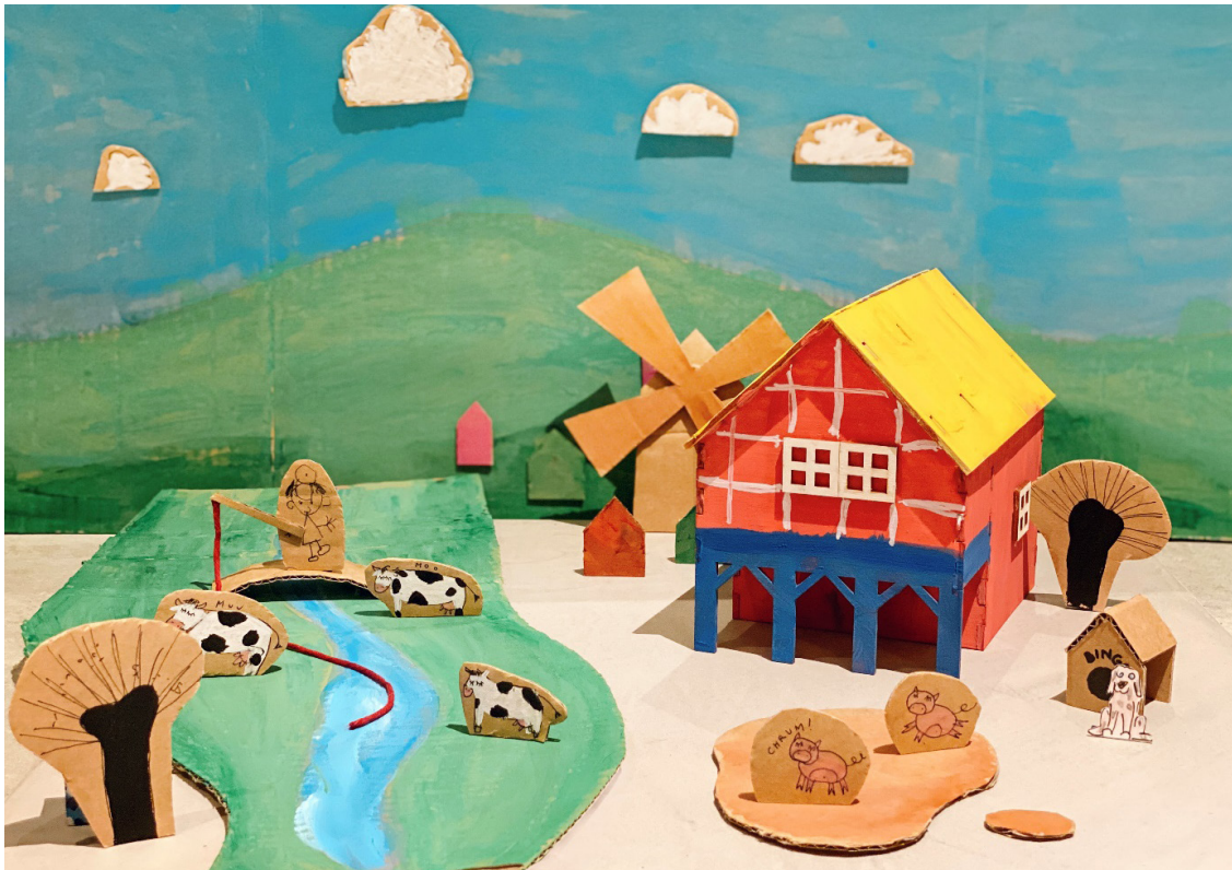
Fig. 5. Additional landscape elements in the work created during online workshops.

Thus, Komorowska's observations that issues related to landscape and regionalism constitute a small part in relation to the whole range of content taught in primary school (Komorowska, 2008) seem to be still valid, but as the analysis of the conducted informal activities showed – there is a possibility to expand in the field of cultural landscape education during other, additional classes.