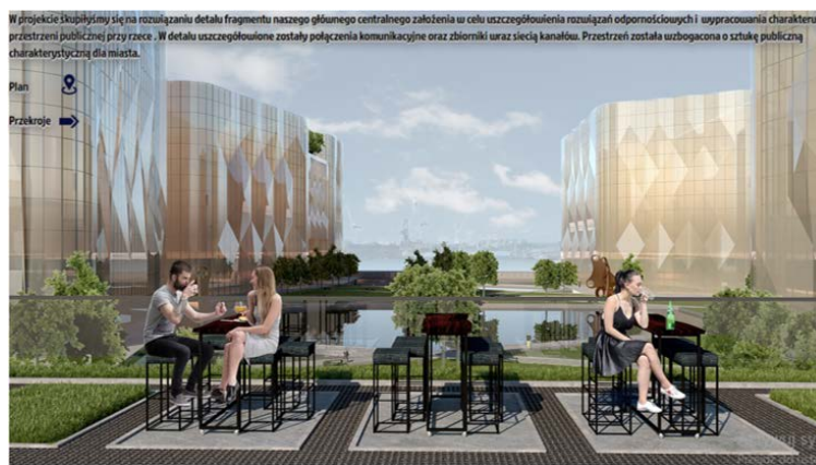
Figure 4: Detailed design of public space (Source: project by Agata Kielecka, Nadia Kocaba, Paulina Kummer and Adrianna Dębowska).

During the course, the students worked in groups with 3D models that allowed them from the start to work with the third dimension of the city structure (see Figure 5). They constructed one large model of the existing neighborhood and individual models for their concepts.