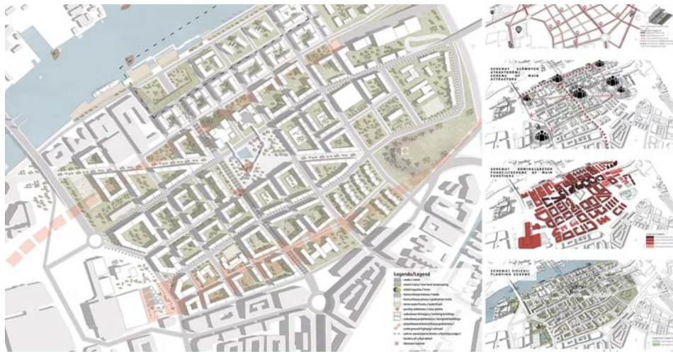
Figure 3: Resilient district - land-use development plan (Source: project by Karolina Zorn, Viktoriia Taraban, Natalia Kontowska and Artem Pasichnyk).