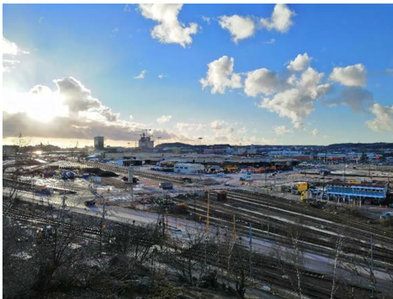
Figure 1: Project area Gullbergsvass district in Göteborg, Sweden.

The area for design was located in Sweden, in Gothenburg, in the Gullbergsvass district, which is a strategic area for a city development (see Figure 1).