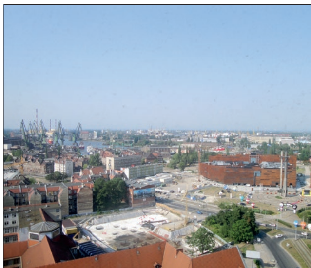
Figure 2 The 'Young City' seen in Gdańsk's post-shipyard transformation