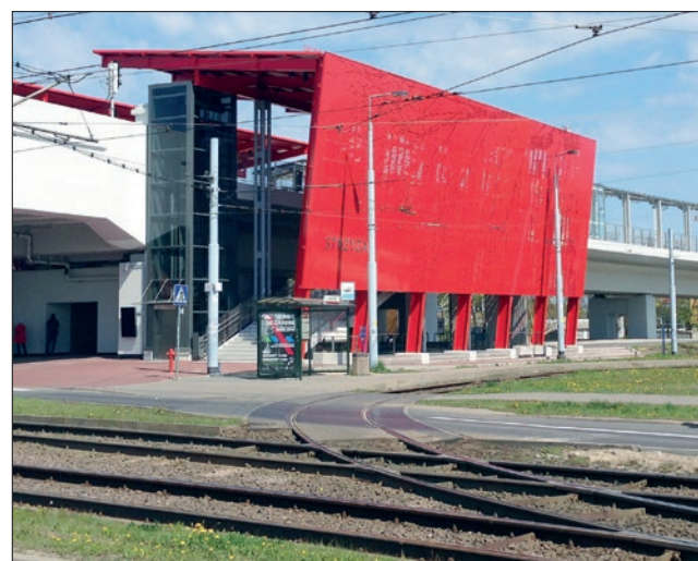
Figure 6 Metropolitan Railway Station – innercity intermodal junction