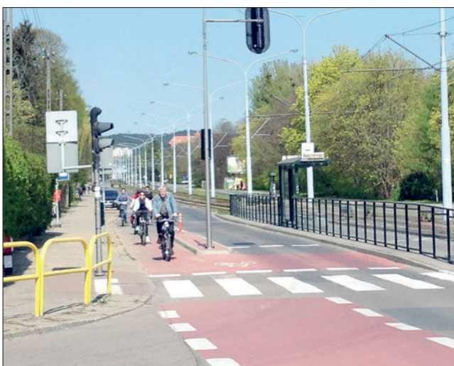
Figure 5 Bicycle infrastructure in Gdańsk

The essential large-scale investments currently being carried out will improve accessibility to answer the needs caused by deficits in the transport infrastructure inherited from the former system. This approach is juxtaposed with new concepts of mobility and sustainability. Only by balancing the present and future needs can a coherent strategy of polycentric development of the city-region be proposed.