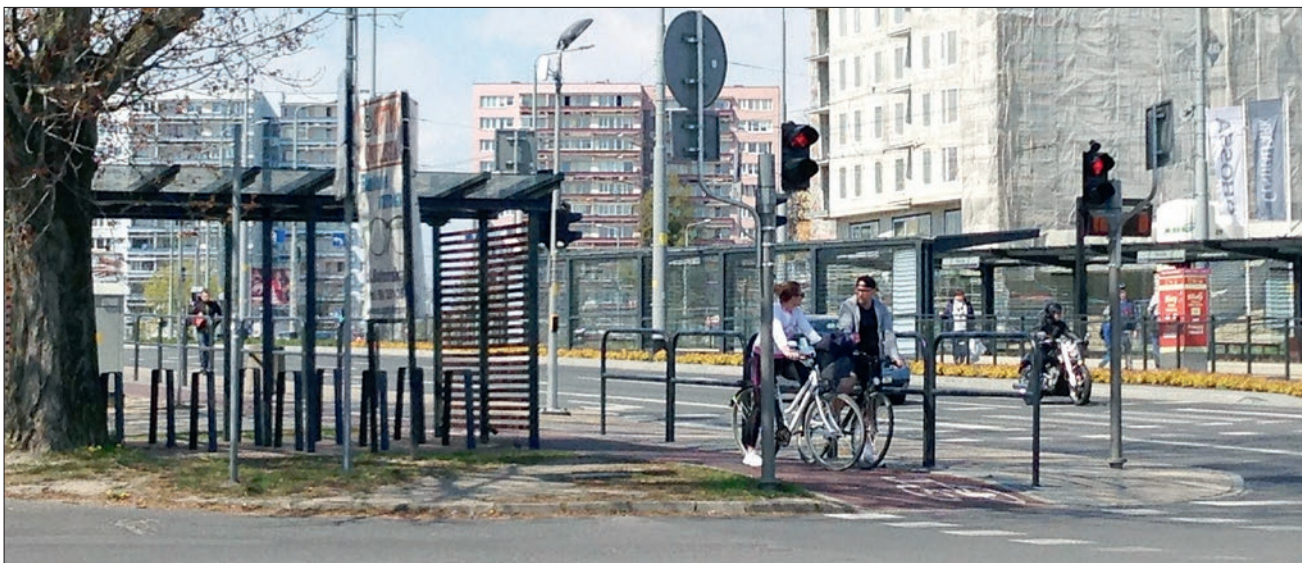
Figure 4 Bicycle infrastructure in Gdańsk