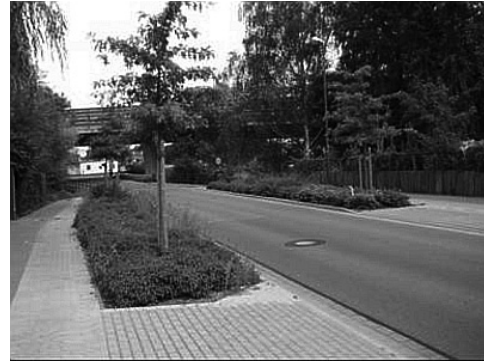
FIGURE 3. Natural gates to a town in Uelzen, Germany (A. Jaszczak)

ery itself may constitute an engineering measure which reduces speed, such as in the form of an entrance gate to a town (Fig. 3).