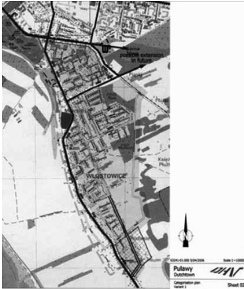
FIGURE 5. Traffic-calming programme in Puławy (K. Jamrozik, 2009)

ment engineering solutions. The project also introduced the following additional engineering solutions: entrance gates to the 30 km per hour zone, bus stops, mini roundabouts, elevated junctions, speed control humps, pedestrian paths and shared bicycle and pedestrian paths (Figs. 6, 7).