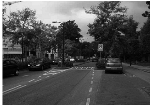
FIGURES 6 and 7. Natural barrier and entry to the 30 km per hour zone (K. Jamrozik, 2009)