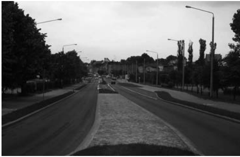
FIGURE 4. An example of a comprehensive set of traffic-calming measures installed along national road 20 in Kościerzyna, Poland

tions. Moreover, if appropriate arrangements are made greenery can be applied as a natural component of traffic calming and in creating aesthetic and permanent zones of calmed traffic. This is how safe public spaces that are friendly towards local communities and provide them with excellent conditions for a neighbourly and social life are established [Jamrozik, 2009]. The paper presents an example of a comprehensive solution in the next chapter.