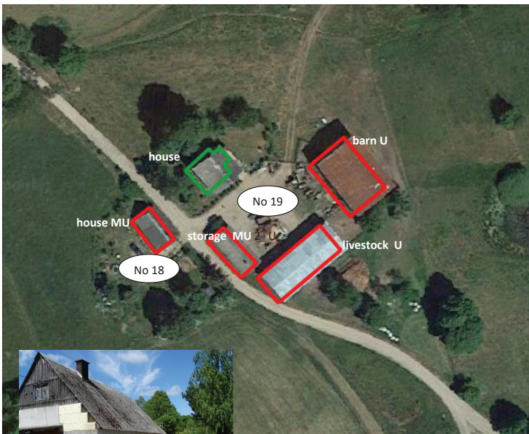
orthophotomap and building data from 2020