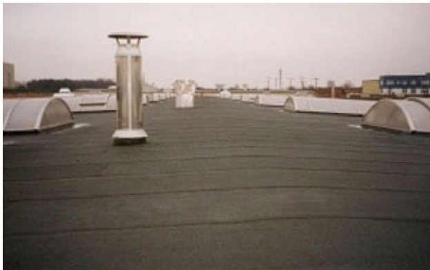
Figure 1: The view of the roof area with an area of 1000m 2 selected for conducting this analysis.

The LCC analysis is carried out accordingly to the methodology contained in [6]. For the purposes of the analysis was defined the time horizon - 70 years were adopted, and then the cost components were determined. The analyzed costs were established based on the knowledge of experts: the investor (the owner of the future facility), property managers responsible for the maintenance of facilities of similar nature and current price publications. According to [24], 70 years occupation time has been adopted (category of performance period: 4/5, designed performance period: 50/100 years). The assumed occupation time was also adopted based on the knowledge of experts - property managers, based on the assessment of the technical deterioration degree of the building made with the use of the Ross method taking into account the scope and frequency of renovations and maintenance of the facility. The discount rate was based on the current NBP information.