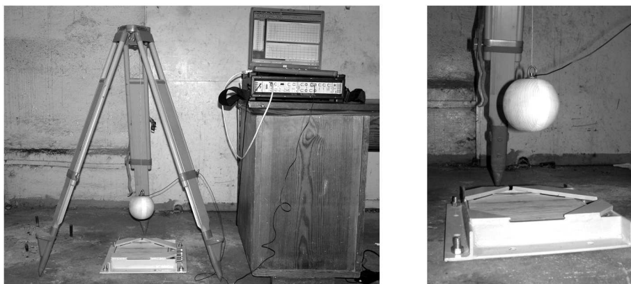
Fig. 1. Experimental setup

the value of e does not depend on the mass of the balls tested but it is much sensitive to the prior-impact velocity. The highest values of the coefficient of restitution have been obtained for ceramic balls, whereas the lowest for timber ones. Moreover, the general trend for all materials shows a decrease in the coefficient of restitution with an increase in the prior-impact velocity.