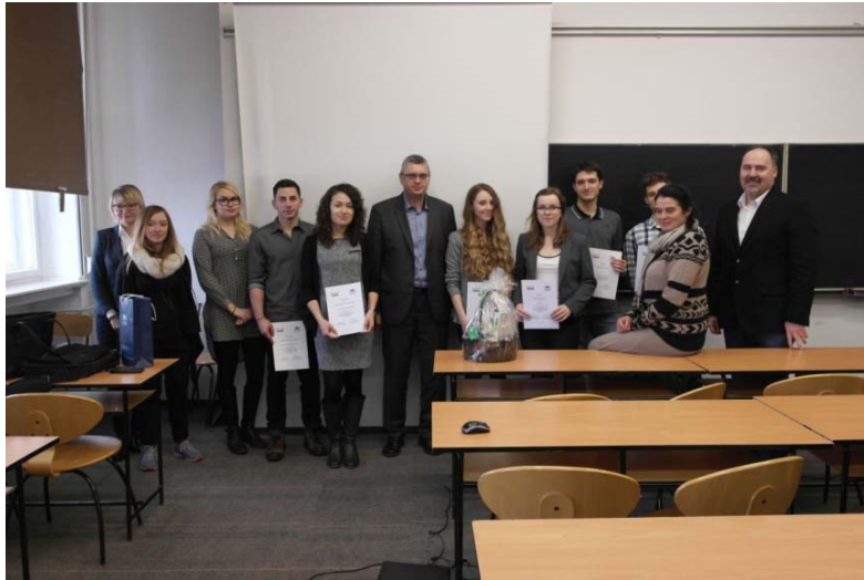
Fig. 3. Competition results and awards ceremony (E. Marczak).