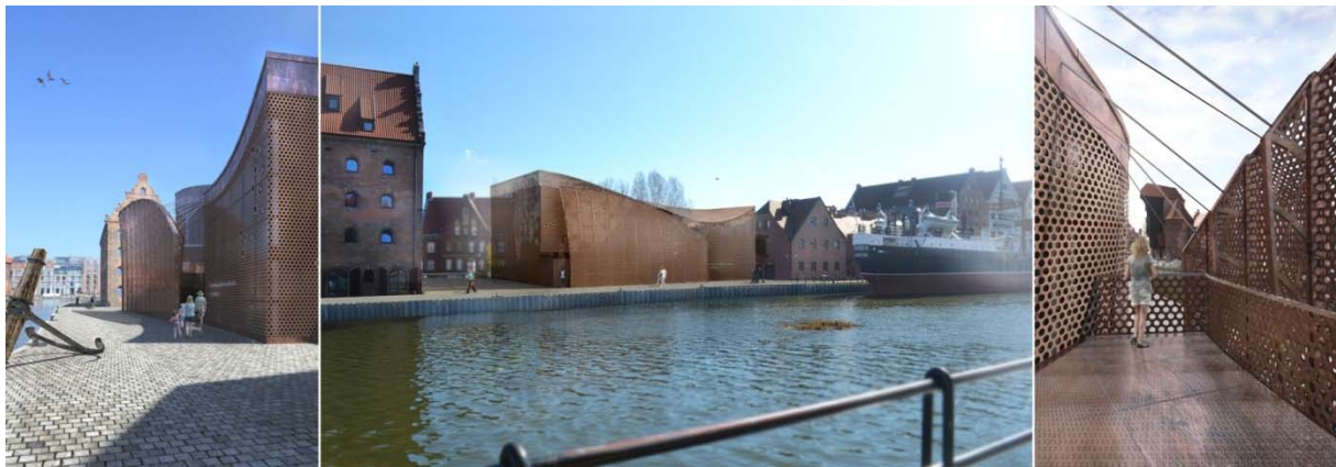
Fig. 5. 2 nd prize in the contest (by M. Skołučka and M. Napiórkowski).