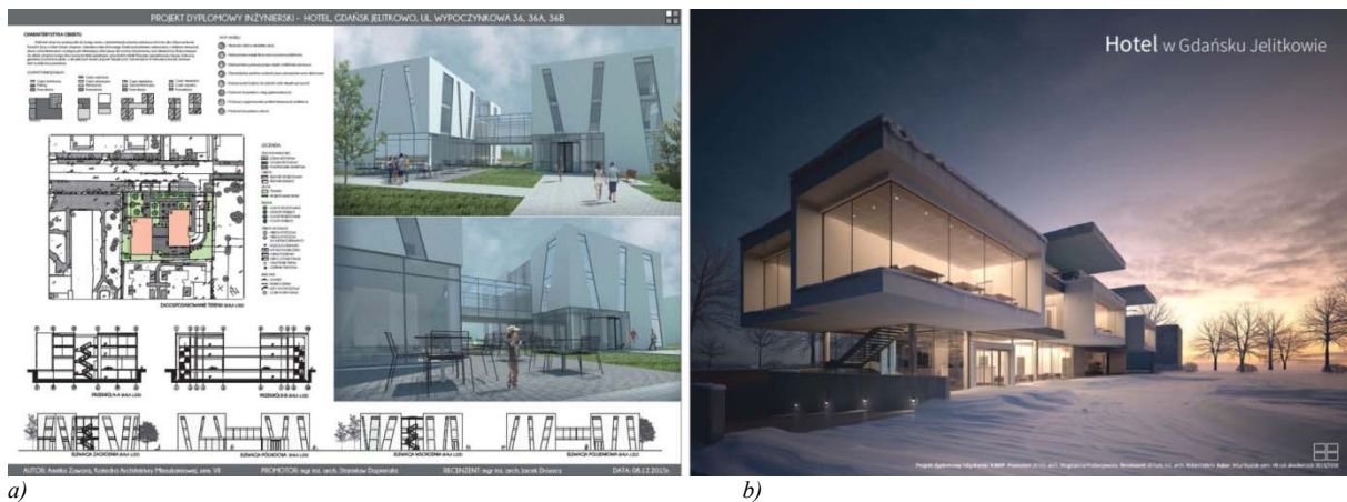
Fig. 2. Diploma works entered in the competition organized by 2a. DORMA (by A. Zawora), 2b. KNAUF (by A. Kusiak)