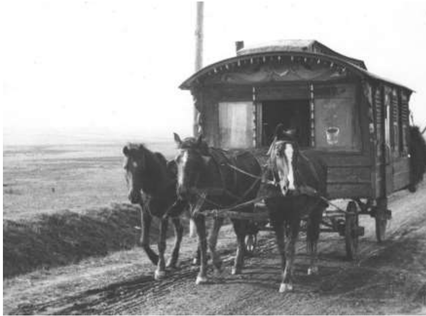
Fig. 1: Gypsy wagon dated about 1930

photographs were imported to the AutoCAD programme, which allowed the authors to build 3D models and establish the approximate dimensions and proportions of the photographed wagons and their details. Results confirmed that this method of digital restitution is reliable since the received dimensions were the same as the dimensions of the existing measured wagons; the differences were less than 5%. This allowed for preparing a hypothetical reconstruction drawing for one exemplary non-existent wagon illustrated in the archive photograph from the first decades of the twentieth century (Fig. 1).