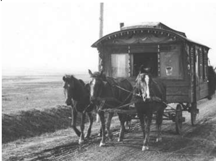
Fig. 1: Gypsy wagon dated about 1930

characteristically decorated wooden mobile houses. Unfortunately, Poland at those times suffered from the imposition of a communist regime. Local authorities could not afford to have groups of people with no legal names and addresses – wandering eluded the concept of a fully controlled state. An action toward the forced settlement of the Gypsies began in 1952, when the government issued a resolution on “help for the Gypsy population in transition to a settled lifestyle” (Bartosz, 1967). Very soon, however, the program turned out to be very radical. Members of the Roma families were forbidden to wander, and were given documents with random names and approximate dates of birth. Subsequent decrees strengthened the pressure on the Gypsies to settle even further (Drużyńska, 2015). Adam Bartosz (1967) marks the year 1964 as the end of the Gypsy nomadic lifestyle in Poland. In fact, Gypsy caravans appeared on Polish roads until the 70s and even 80s of the twentieth century. Forcibly stopped, the Gypsy families were offered low quality flats or temporary barracks for seasonal workers (Bartosz, 1967). With no education and no earning prospects, they found themselves very soon at the margin of society (Guy, 2001). Immobilised wagons put aside deteriorated with the passing seasons. In some of them, families had lived for years without any access to electricity or water supply. Many owners, who discovered they would never return to wandering, just burnt their mobile houses.