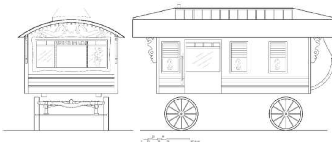
Fig. 4: Exemplary reconstruction of the historical Gipsy wagon

Source: Agnieszka Szuta, Jakub Szczepański, Lucyna Nyka, in-situ inventory drawing, 2018.