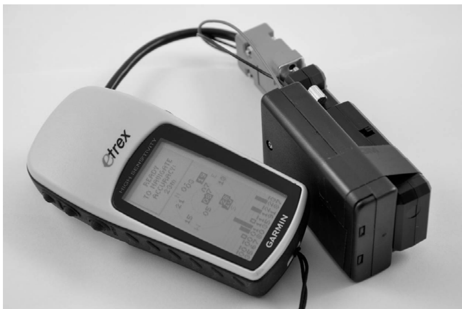
Fig.3. External DGPS receiver connected to the Bluetooth adapter.

Positioning with inexpensive GPS receivers is often inaccurate and unreliable [5], especially in urban areas. Therefore system's GPS unit was upgraded with additional, external DGPS receiver, which uses differential corrections obtained from ASG-EUPOS polish DGPS network (Fig. 3.). That receiver connects with smartphone using Bluetooth technology and improves positioning precision significantly (with mean error of 3-4 metres, depending on service used [8]). Additional accuracy gains are highly desired, so further improvements, based mainly on inertial navigation [6] are currently under our investigation.