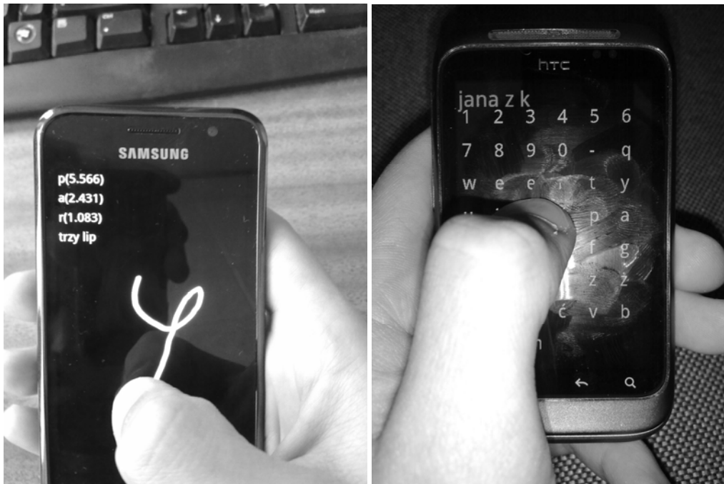
Fig.6. Sample text input method: based on gesture recognition (on the left) and letter choosing (on the right).