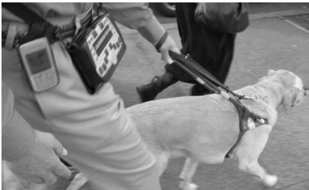
Fig.1. Sendero GPS in action.

There are more systems for the blind, for example Loadstone GPS [3] or polish Navigator [4], but their capabilities are even lower, as they use sets of points instead of full maps.