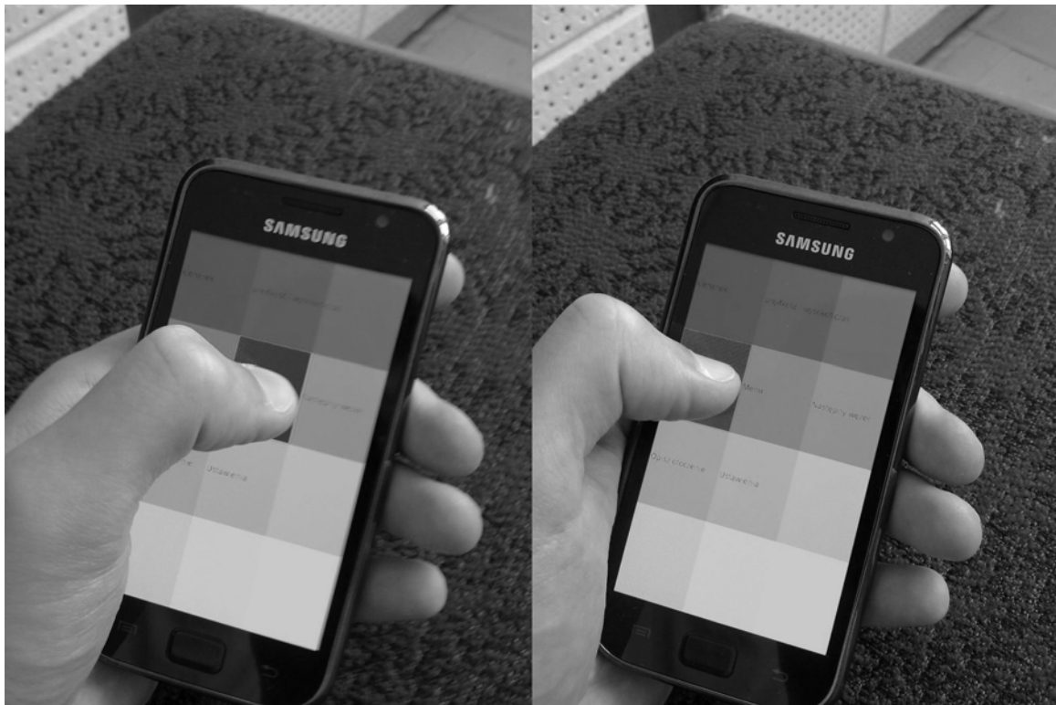
Fig.5. Touch menu for the blind.

Users communicate with the system using mainly touch screen. The menu is arranged in a form of a tree. The options of the current part of that tree (the part that the user has entered) are placed on the screen, each of them occupies a rectangular area of significant size. User moves his finger on the touch screen (Fig. 5.), feels vibrations when he leaves one rectangular area and enters another, and hears name of the option that he has just moved to. The last touched option is considered as a selected one. Double tapping on the screen will activate selected option, either moving the user to another sub-tree of the menu, or triggering certain action, e.g. activating verbose mode of messages. On the right-bottom corner of the screen there is also “Back” option, which takes the user back to the upper/previous part of the menu. The menu can be also used on devices without touch screens. In that case, arrow keys are used to move around and one of the action keys replaces double tapping.