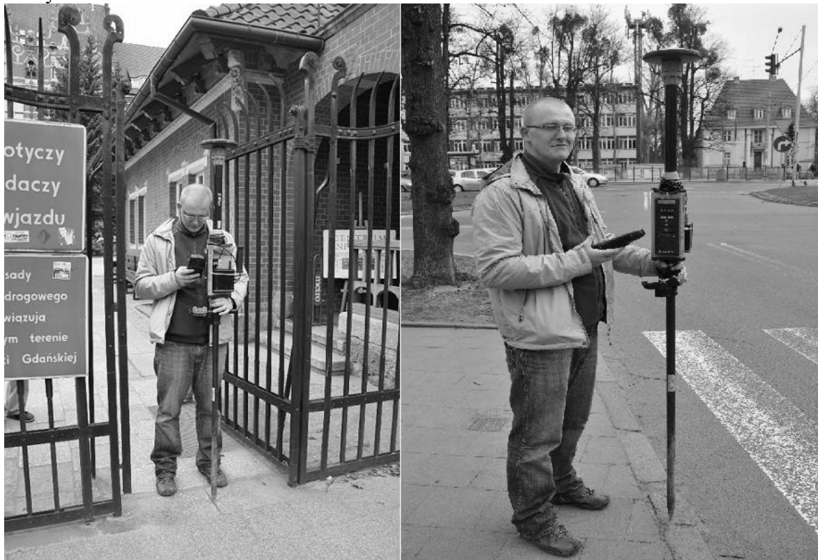
Fig.4. Precise data acquisition with geodetic DGPS receiver.

The precision of community-driven data acquisition is usually not high, both due to possible mistakes of operators and because of weak accuracy of commonly used GPS receivers. Therefore spatial data collection with the use of precise, geodetic DGPS receivers was also tested (Fig. 4.). It is expensive and time-consuming, but extremely accurate. That is why it is planned to be used for spatial data acquisition in crucial and most dangerous areas in the city.