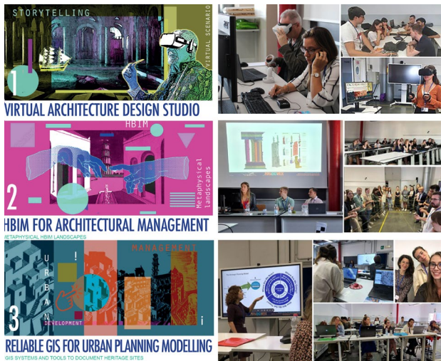
Figure 5. The Pavia Digiweek 2022, including conferences, seminars and workshops, was an opportunity to experience the effectiveness of teaching from different points of view. Three workshops were organised allowing teachers to collaborate verifying each other's skills and noting the need to standardise the languages. At the same time, the different learning methods of the students with respect to the curricula of origin were verified.

All panels foresee the participation of experts from each HEIs, with the aim of comparing the respective courses and training skills, selecting or improving the more adequate solutions for didactic courses and curricula, and designing the educational plan for VREA joint Master programme.(Fig. 4) The panels also discussed the involvement of Third Parties, the professional and administrative sphere, in the educational curricula, to ensure practical training experiences at the end of the 2nd year of the Master programme. Dialogue with Third Parties was necessary to understand the general and development rules of any internships. This macroscopic sharing will also be useful in the future to other interested companies. The training activities at Third Parties must prepare the students to develop the final research-oriented thesis required for the achievement of the degree.