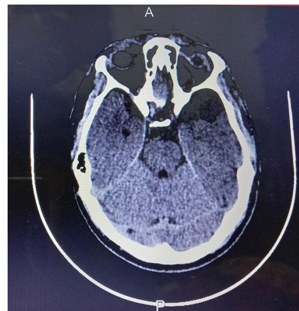
Figure 2: Axial view of Computed Tomography Scan of Arachnoid cyst seen at left temporal lobe.