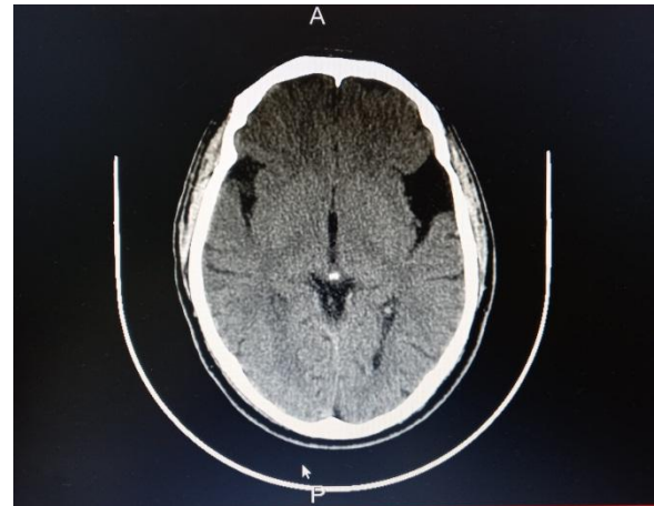
Figure 1: Computed Tomography Scan of the brain without contrast showing Arachnoid cyst at left temporal lobe.

still he is socially isolated and having scanty induced speech.