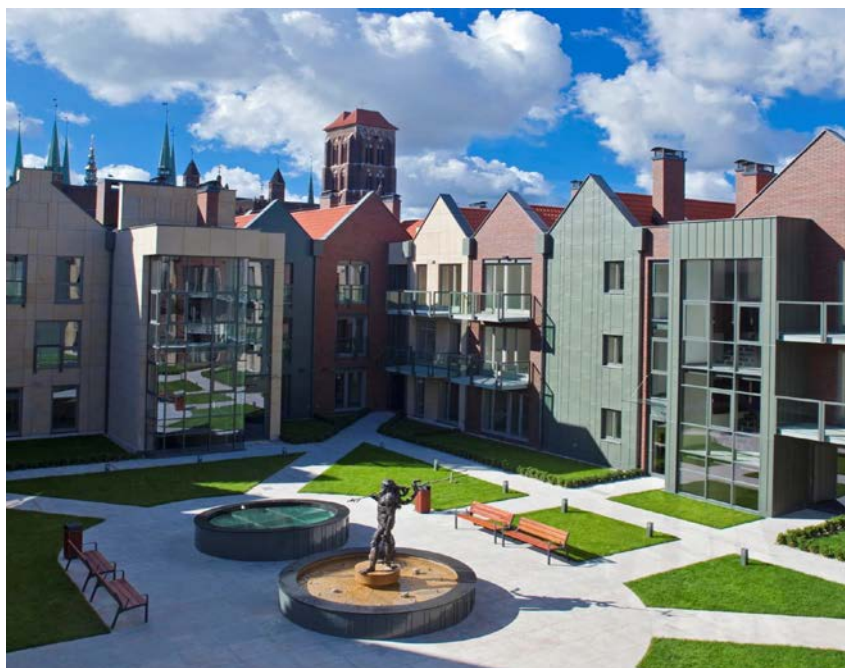
Figure 4: Architecture that can be perceived with all the senses - a housing complex in Gdańsk (Source: FORT Tarasziewicz Architekci Sp. z o.o. in Gdańsk).

Rasmussen writes about experiencing architecture through such elements as: solid shapes and emptiness, contrasts, colour planes, scale, proportions, rhythm, texture, light or even of hearing architecture [4]. This holistic approach to experiencing architecture with all the senses allows contemporary man to open up to various impressions, and through their perception to reveal his true, individual psychological needs and his true essence. Architecture is my space and, emotionally, only mine (Figure 4).