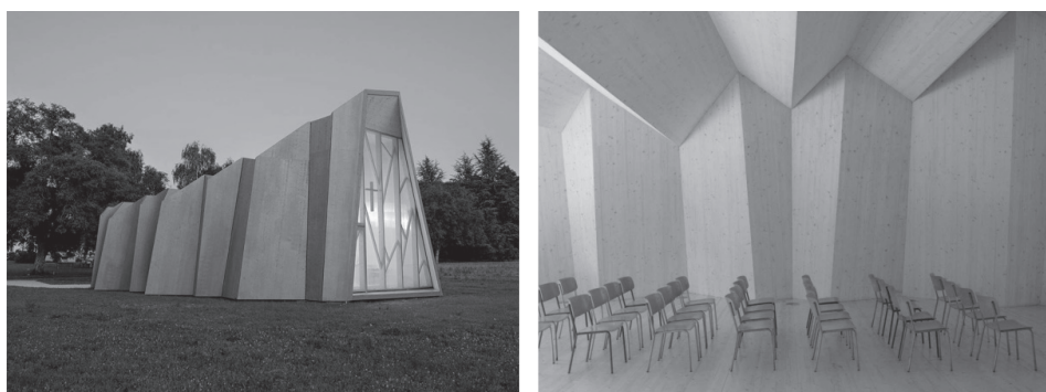
Figure 3. The temporary chapel for the Deaconesses of St-Loup. On the left: a view to the opening on the façade; on the right: a view from the inside.

terpretation of the traditional religious space. This facility is in peaceful harmony with its environment 9 .