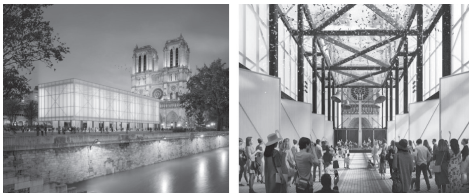
Figure 4. Proposition of a temporary, multifunctional structure near the Notre Dame Cathedral. On the left: a visualization from the exterior of the designed pavilion; on the right: a visualization from the inside of the designed structure.

tures made this chapel a popular place among employees of local businesses, local residents and tourists. For four years it served as the spiritual center of Hafencity.