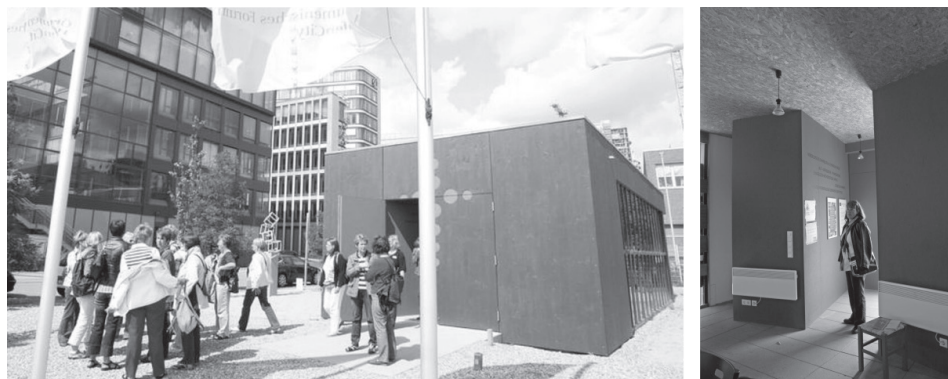
Figure 5. The temporary chapel in Hafencity. On the left: a view from the exterior; Source: (Teggatz 2015); on the right a view from the interior, August, 2010. Source: photo by J. Szczepański.