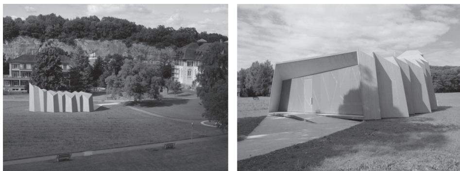
Figure 2. Exterior of the temporary chapel for the Deaconesses of St-Loup, Switzerland. On the left: The shape of the chapel resembles origami; on the right: a view of the entrance to the chapel.