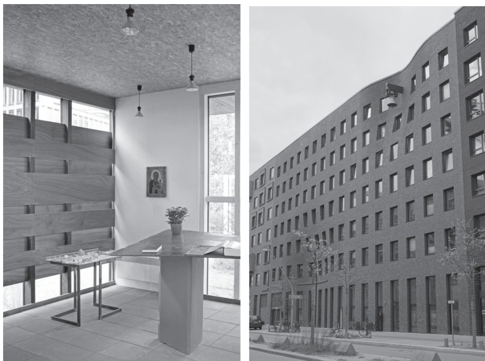
Figure 6. On the left: the temporary chapel in Hafencity – a view from the interior, August, 2010. on the right: The Ecumenical Forum with a separate ecumenical chapel on the ground floor, May, 2016.