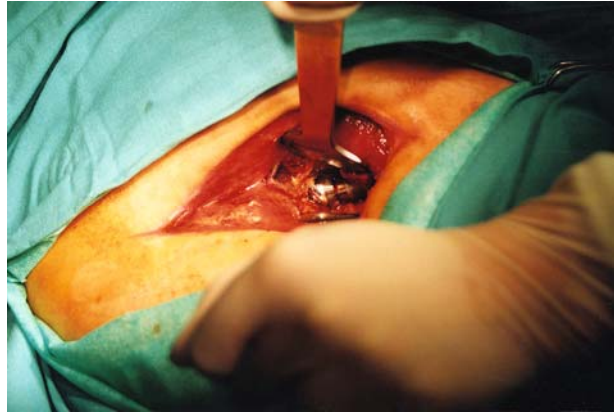
Fig.4. The hip implant removing caused by aseptic loosening

Two of them (1,2) had their implants removed due to aseptic loosening and intolerance of endoprosthesis. It resulted in pain, fistula serosa and edema. There were found to have oversensitiveness to Cr and Co. The allergic were not diminished by using antihistaminic drugs (Fig.4).