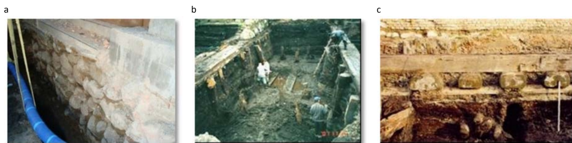
Fig. 1. View of foundations: (a) historical building in Olsztyn at Staromiejska Street; (b) old granaries at Basztowa Street in Gdańsk; (c) old granaries at Chmielna Street in Gdańsk.

Stone foundations were mostly used for sacred buildings and public utility structures. Various types of stones were used, depending on the function of specific elements of a building, the available equipment and workmanship, and the geographic location. Often granite, limestone, sandstone, sandstone volcanic tuff, or even marble was used. The majority of stone foundations of historic buildings did not have offsets at all or they were not extended to the bottom. In addition, it would've been difficult in the past to find mortar that would be in accordance with currently recommended mortar strength requirements (excluding pozzolan). The fact that such foundations are still effectively supporting many historical buildings should therefore be explained by their oversized measurements. Figure 1 presents the views of a few medieval foundations located in two Polish towns.