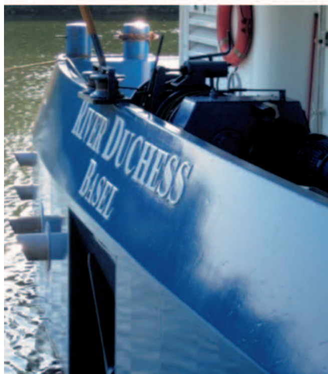
Fig.3. Examples of the anchoring and mooring equipment arranged in the stern part of various inland waterways ships .