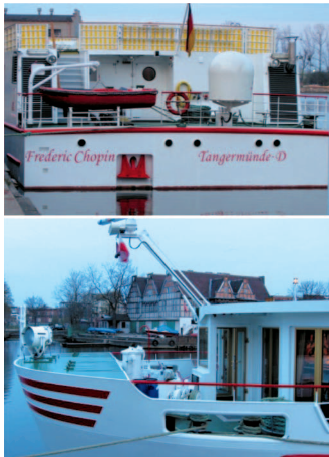
Fig.1. Anchoring and mooring equipment arranged in the bow and stern part of the tourist ship „Frederic Chopin”.