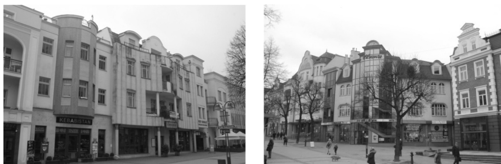
Figure 3. Examples of post-modernism buildings in the street frontage; the apartment building Three Graces (left) and the department store Monte (right)

Post-modernism, like historicism, is another architectural trend which derives from eclecticism. The main feature which distinguishes post-modernism from historicism is creative interpretation of historical models – interpretation, not imitation. Post-modernistic architecture is creative; while drawing from historical forms, its aim is to transform them in an original, modern way. Post-modernistic architecture and its unique character is connected with architectonic detail. The detail, which is the result of the artistic vision of an author, creates post-modernistic architecture – the architectonic form usually remains traditional. Despite the fact that post-modernism practically did not appear as a prevailing trend at the turn of the 20th century, buildings of different sizes, representing this trend, have been constructed in Sopot. In Bohaterow Monte Cassino street, which is the main pedestrian precinct in the representative part of the city, two buildings were constructed as infills in the existing street frontage. Both of them respect the scale of their surroundings (they relate to the scale and division proportions of a historic tenement house), and constitute examples of balanced post-modernism, with characteristic, original, post-modernistic detail. Today both buildings integrate well with the historic context of the city dating back to the turn of the 20th century (figure 3).