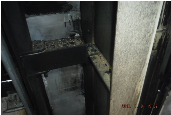
Fig. 4. Visible fire impact on steel construction elements.

Visual inspection shows that the insulated wall assembly with a sheet cladding and insulated membrane roofing on top of self-supporting sheets is partially damaged (see Fig.2) thus it should be removed and replaced. The main structural elements of I-section steel column and transoms (see Fig. 4) can be generally classified to the 1st category. However, small deformations of steel members were detected by visual observation, surfaces of selected structural members detect tightly adhering mill scales and surface erosion, denoting a high temperature exposure. In general, steel loses its mechanical properties in high temperatures (see e.g. [21]). Uniaxial tensile tests were further performed to assess specified post-fire parameters of I-section steel members.