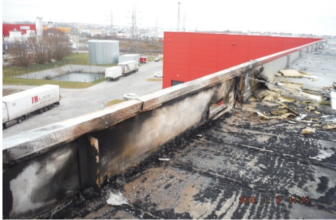
Fig. 2. View of fire damage to the roof elements.