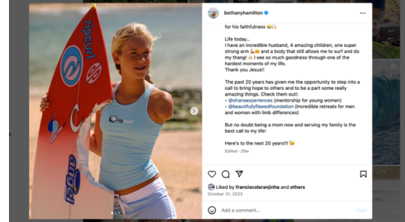
Figure 3. BH’s post on the new self, inventing new practices within the same and new communities

Data reveals that the creativity and innovation by newly disabled people can occur within existing communities (e.g., providing coaching activities) or lead them to enter new communities (e.g., coaching to anyone who wants to find inspiration and strengthen their mental health). Moreover, the individuals innovate both within the same industry (e.g., in sportswear, creating products and prosthesis for body injuries) and in new industries (e.g., offering retreats for those with body injuries and disabilities, and for anyone who wants to find inspiration and strengthen their mental health). The varying extent of innovation is shown in Figure 3 and outlined in Table 2.