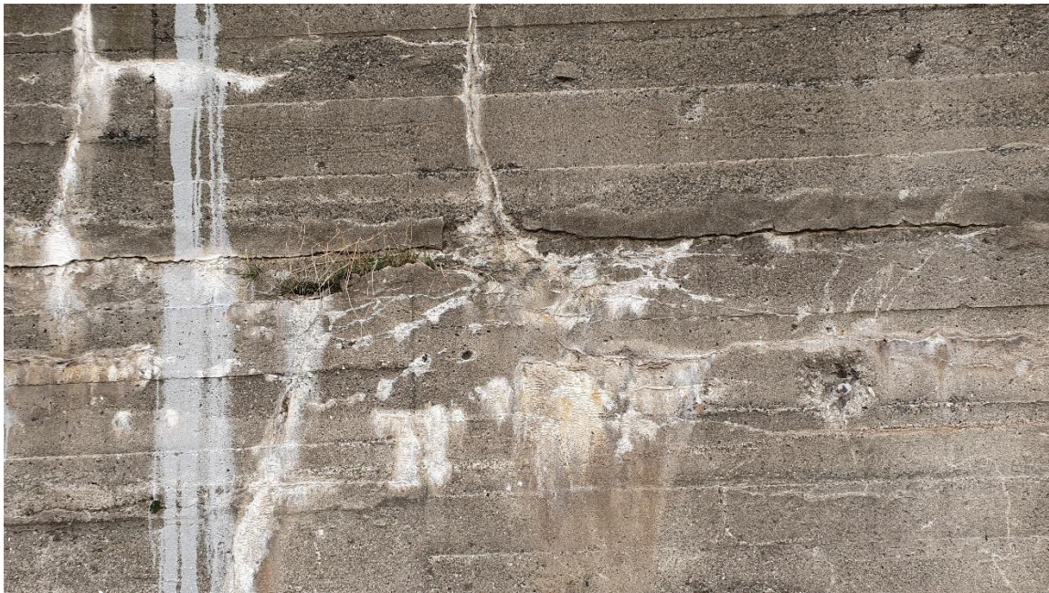
Photo 2: Examples of calcium carbonate leaks on the south-west elevation (external gable (transverse) wall from the land side (left)) of the Bunker building