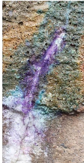
Photo 5: Discoloration of concrete after the Rainbow Test on the concrete surface, in the place of a crack on the wall of the right annex - test site after the test: a) view, b), c) close-up: green-violet coloration indicates advanced carbonation of concrete and its reduced ability to protect the reinforcement, the orange color indicates advanced carbonation of the exposed concrete surfaces, washing out of calcium carbonates is visible in the area of cracked concrete fragments