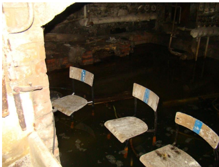
Fig. 2. Flooded basement of the building to a height of 0.45 cm above the level of the basement floor: the original groundwater level ~120 cm below the foundation level of brick footings (difference between the original state and the state shown in the illustration: ~265 cm)

As far as historic buildings are concerned, it is also often the case that cracking and displacement of individual parts of them, including masonry also occur in the area of old urban districts due to the collapse of formerly existing underground structures, such as multi-level underground parts, passages and canals.