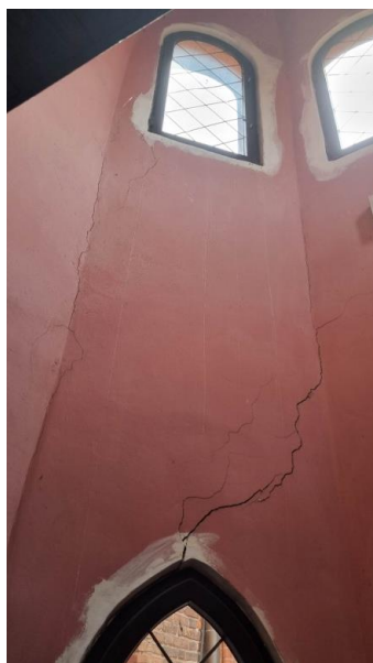
Fig. 6. Cracking of the exterior masonry of solid ceramic bricks caused by above-normal settlement of a section of the building