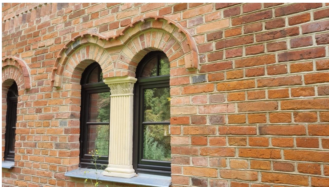
Fig. 19. Revitalization of historic solid ceramic brick wall using contemporary brick and ceramic tile and limestone details