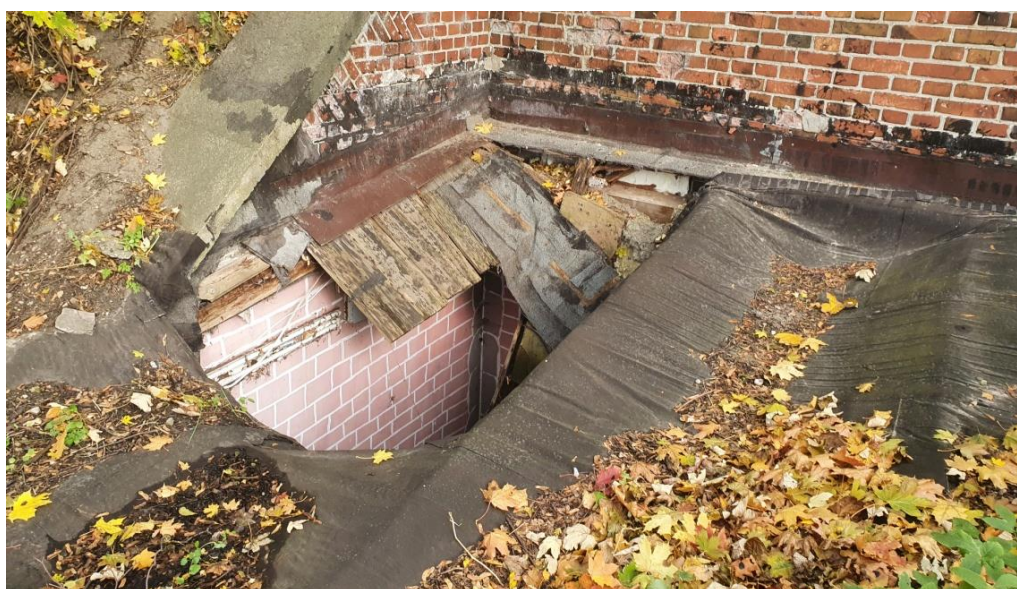
Fig. 15. Moisture damage to ceramic masonry as a result of water flooding caused by the collapse of a moisture-damaged and biologically corroded wood-framed roof: a) view, b) close-up