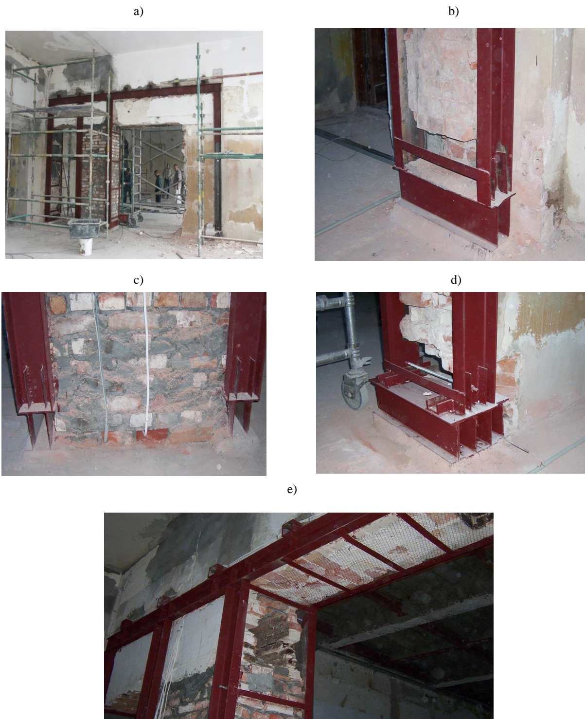
Fig. 17. Making door openings in the inner wall of solid ceramic brick: a) view of the steel frame, b), c), d), e) construction details