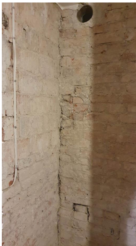
Fig. 13. No masonry bond between transverse and longitudinal interior walls made of ceramic solid brick

In terms of execution errors and shortcomings in historic buildings dating from a bygone period with regard to brick masonry, the following problems stand out: