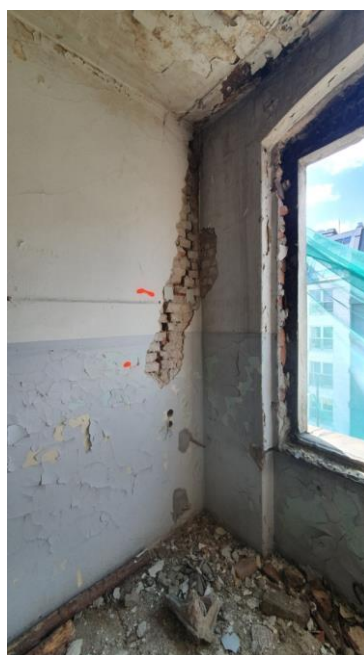
Fig. 11. Cracking of the internal transverse wall made of solid ceramic bricks at the point of connection with the external longitudinal wall in a building with ceilings on wooden beams that do not have frontal and lateral anchoring