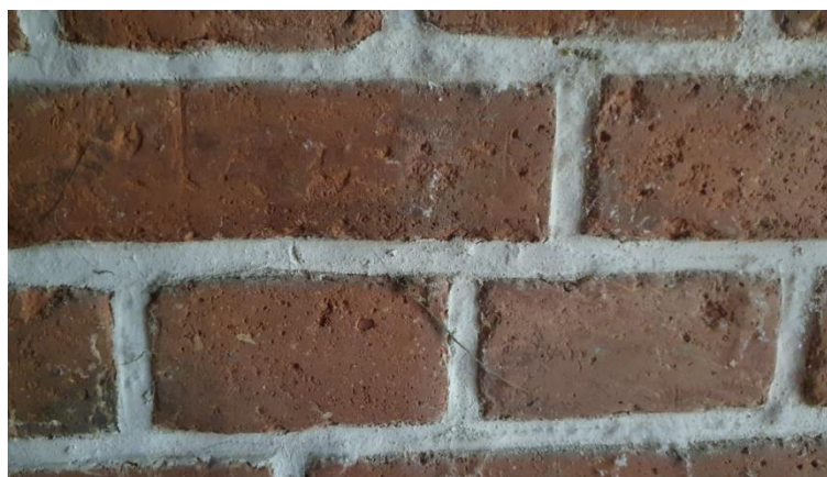
Fig. 1. Open pores and capillaries of the exterior masonry of solid ceramic brick, visible cement mortar tight joint improperly executed in the past period during renovation work

Brick masonry structures exposed to strong solar heating or subjected to low temperatures experience spatial deformations, the extent of which depends on their massiveness. Accordingly, deformations on the surface of masonry are visible in the form of fine cracks and fissures [7].