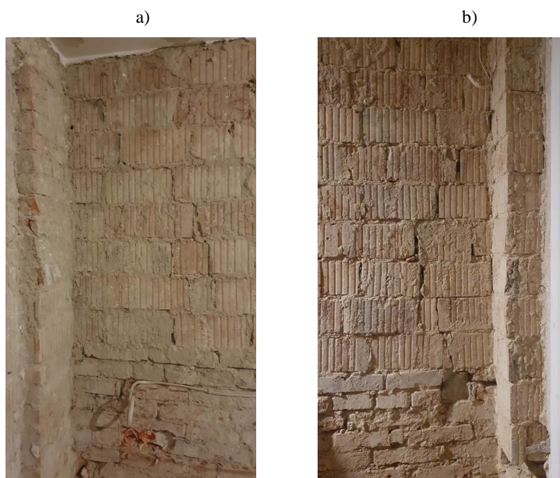
Fig. 10. Thorough cracking of the interior transverse wall made of ceramic grid brick at the point of connection with the exterior longitudinal wall made of ceramic solid bricks in a building with wooden beam ceilings not having frontal and lateral anchoring