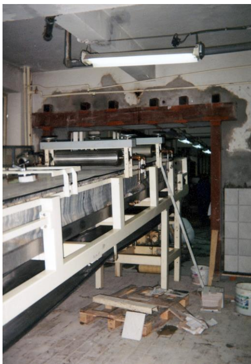
Fig. 18. Widening of the door opening in the inner wall of solid ceramic brick – view of the steel frame construction