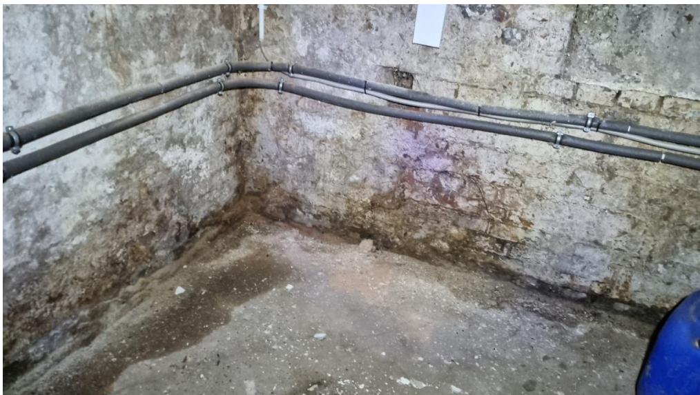
Fig. 8. Dampness of the external masonry of solid ceramic brick caused by the lack of horizontal damp proofing in the part sunk in the ground and the lack of technical efficiency (leakage) of the vertical damp proofing membrane