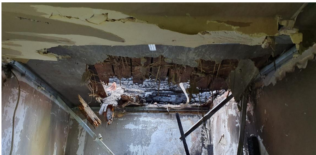
Fig. 14. Moisture damage to exterior and interior ceramic walls as a result of water flooding at the site of a broken roof

One of the measures that counteract the uncontrolled and progressive decapitalization of an immovable monument is conducted in accordance with the requirements of specific regulations: