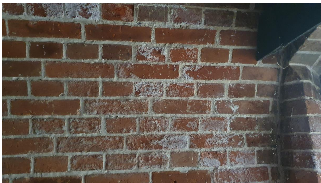
Fig. 4. Development of biological corrosion on the interior surface of the exterior solid ceramic brick masonry, visible cement mortar tight joint improperly executed in the past period during renovation work

Active bacterial and fungal activity can be recognized not only by the appearance of mold and plaques on structural parts, but also by the characteristic odor.