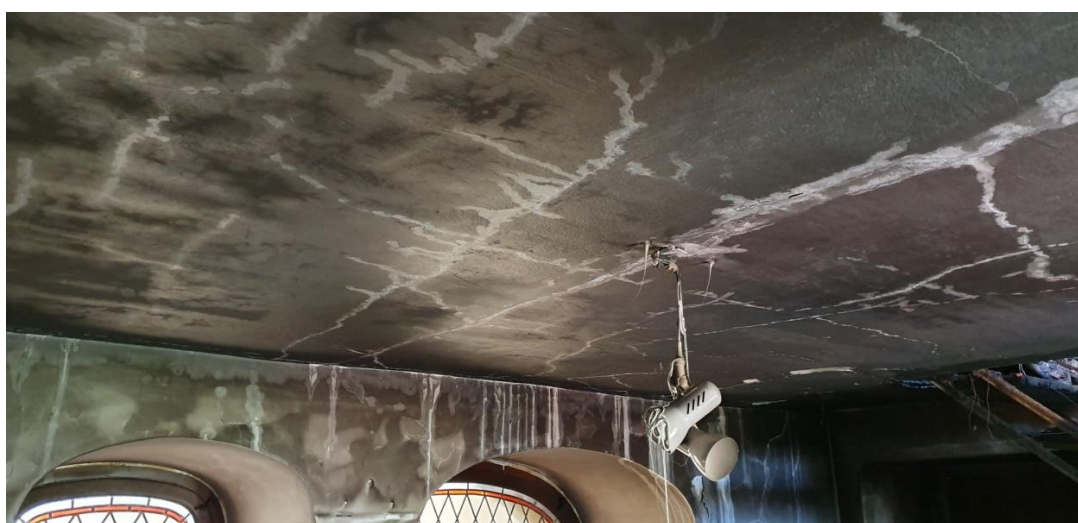
Fig. 5. Fire damage to solid ceramic brick wall and ceiling on wooden beams, visible cracks in plaster on wall and ceiling

The destructive effect on brick masonry elements of domestic animals, especially cows and horses, and birds, especially pigeons, should also be mentioned here. Animals contribute, among other damages, to the growth of moisture and the secretion of harmful salts that result in the development of destruction of masonry elements.