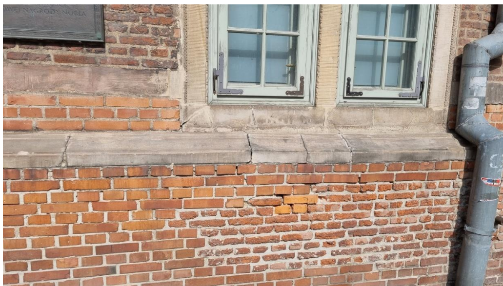
Fig. 9. "Hollow joints" of the exterior masonry of solid ceramic brick, additionally visible frost damage and weathering of the wall