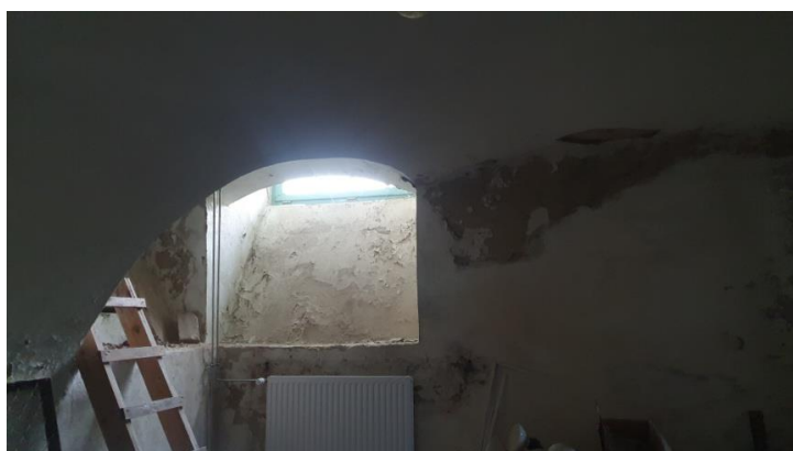
Fig. 7. Dampness of the external wall made of solid ceramic brick caused by the lack of vertical damp proofing in the part sunk in the ground

In the case of historic buildings from a bygone period, especially with regard to medieval and Gothic religious buildings, it should be remembered that their implementation was based on the professional experience of the builders of the time [25], [26]. Design documentation was simplified, or reduced to a drawing (painting) which, using modern terminology, corresponded to a conceptual design. The solutions adopted and directed for implementation were not supported by detailed static-strength calculations: this also applies to the construction of brick masonry and brick vaults, commonly used in religious buildings. However, taking into account the time realities inherent in the period of implementation of this type of buildings, it can be assumed that the main design errors and shortcomings include: