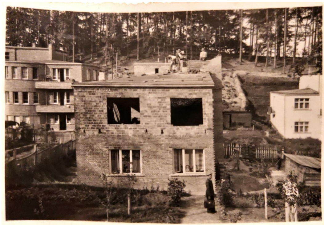
Fig. 12. Building with layered exterior walls (with air cavity), made of ceramic bricks: a) solid, at the level of the ground floor, b) trusses, at the level of the first floor