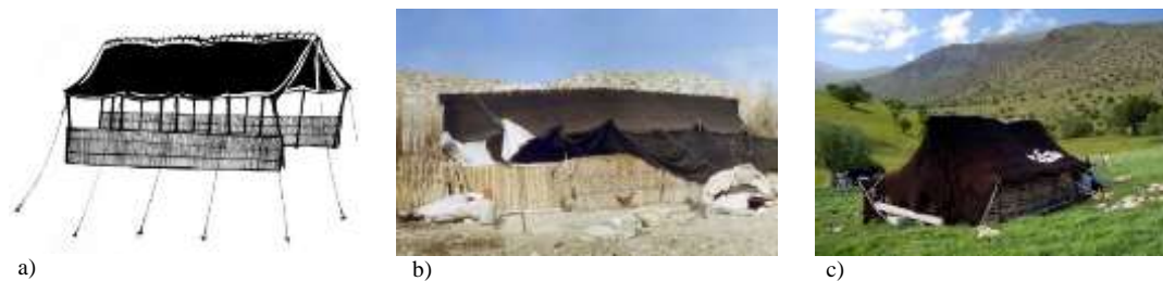
Fig. 1a, 1b: Black Tent of Ilam province; Fig. 1c.: Black Tent of Chaharmahal and Bakhtiari province

The Black Tent and typical nomad housing can be found in the Zagros Mountains (Fig.1a, Fig.1b, Fig.1c). The Zagros Mountains are located in the western and southern part of Iran in the provinces of Ilam, Kermanshah, Kurdistan of Kohkiluyeh and Boyerahmad, Chaharmahal and Bakhtiari, Esfahan and Fars.