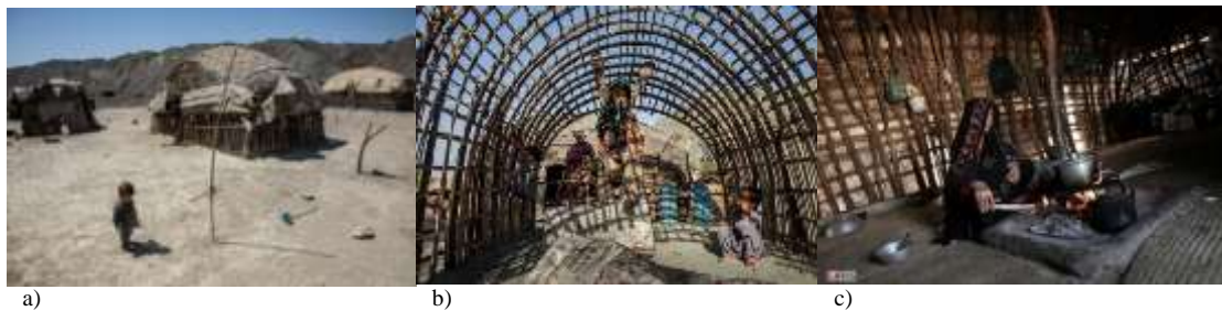
Fig. 9a, 9b, 9c: Kapar Tent; Structure of the Kapar; Interior of the Kapar

Kapar is a kind of structure found in the southeast and south of Iran. The materials used to make these dwellings are wood, straw, goat wool or camel hair, branches and leaves. The curved branches are banged into the ground and then formed to build a wall, then branches of the palm tree are used horizontally. To cover the roofing in the winter, they use woolen felt.