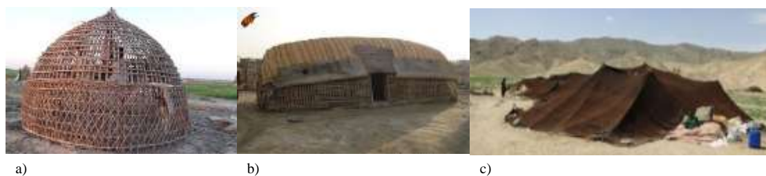
Fig. 2a: Kapar of Kerman province, Fig. 2b: Kapar of Sistan and Baluchestan province, Fig. 2c: Kapar of Khorasan province

Tents can also be found in the eastern and southeastern parts of the country, which includes parts of Khorasan, Sistan and Baluchestan, and Kerman and Hormozgan provinces (Fig.2a, Fig.2b, Fig.2c). Here special weather conditions prevail. In this area, climate diversity is severe, and in general, this region has low water levels and low rainfall with hot weather and a great difference in temperature overnight. Kapar is one such hut made in the southern part of Kerman province. Usually, huts in Kerman have a circular shape and in the Sistan and Baluchestan provinces the hut (kabar) has an ellipsoidal shape with a lower ceiling.