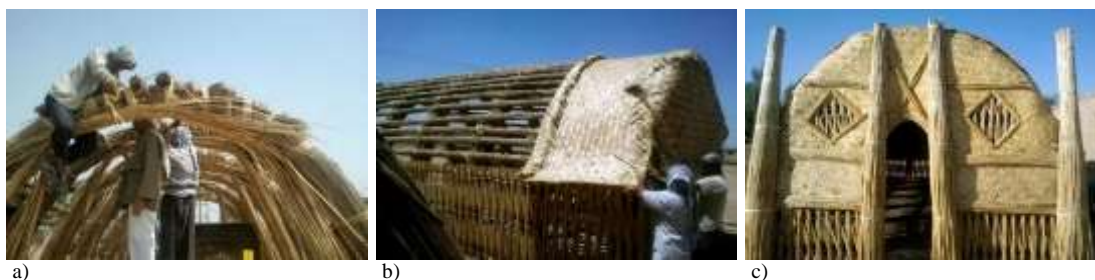
Fig. 10a, 10b, 10c: Construction processes of Mazif