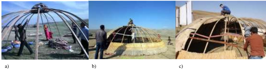
Fig. 8a, 8b, 8c.: Structure of the Alachigh, Shahsawan Tribe, Azarbayjan Province

The Alachigh is usually made in cold and mountainous regions, and the plan is circular and hemispherical. The Alachigh is composed of two parts. The upper part of the roof is woven from goat hair. The other part is the sidewall, which is called chih or chit, and it is made up of a combination of goat hair and thin branches.