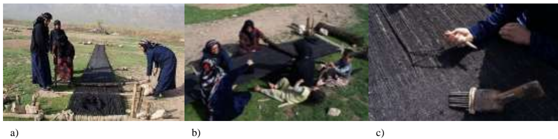
Fig. 7a, 7b, 7c : Nomadic women weaving a strip of Black Tent in Ilam Province

Beside the Black Tent in Iran, there are other examples of housing used by nomadic people like the Alachigh, Kapar or Mazif. Different characteristics are found in different geographical areas of Iran.