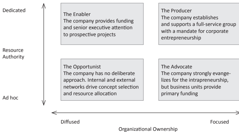
Figure 2. The four models of corporate entrepreneurship

Wolcott and Lippitz (2007) conceptualize four models of CE, including: the opportunist, the enabler, the advocate and the producer model. The framework is composed of two dimensions: organizational ownership (who within the organization has primary ownership for the creation of new business?) and resource authority (is there a dedicated “pot of money” allocated to CE?). In the opportunist model, CE is based on the efforts in spite of the corporation of project champions, while in the three following models, CE is actively managed.