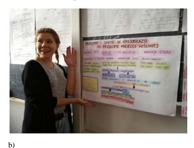
Figure 1: a) Groupwork on a specific task; and b) Result of students' groupwork.

The teaching method was focused on co-operation (students work in pairs or in larger groups); self-education (individual tasks, searching for sources of information, identification of methods of obtaining different data); a participatory approach (engagement and active involvement in the education process: students are encouraged to exchange their thoughts and views, to co-operate, to present their findings, to discuss), interdisciplinary studies in the EIA (stressing the need of interdisciplinary studies during lectures and presenting case studies); and state-of-the-art knowledge (materials from the latest literature and conferences). See Figure 1 and Figure 2.