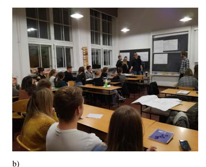
Figure 2: Discussions and presentations of students' findings.