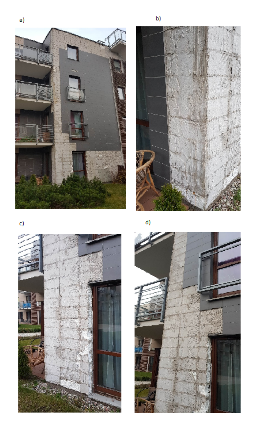
Figure 1. Damaged ceramic cladding a), b), c) and d) of the building facade

On the façade fragments made of ceramic tiles, extensive blooms were visible, occurring at the joints between individual ceramic tiles. 50% of the façade surface made with the use of ceramic cladding had damage in the form of its detachment from the substrate, i.e. from the adhesive layer, made on a heat-insulating material such as polystyrene. These damages occur over the entire height of the building, at the height of 4 above-ground storeys (Fig. 1).