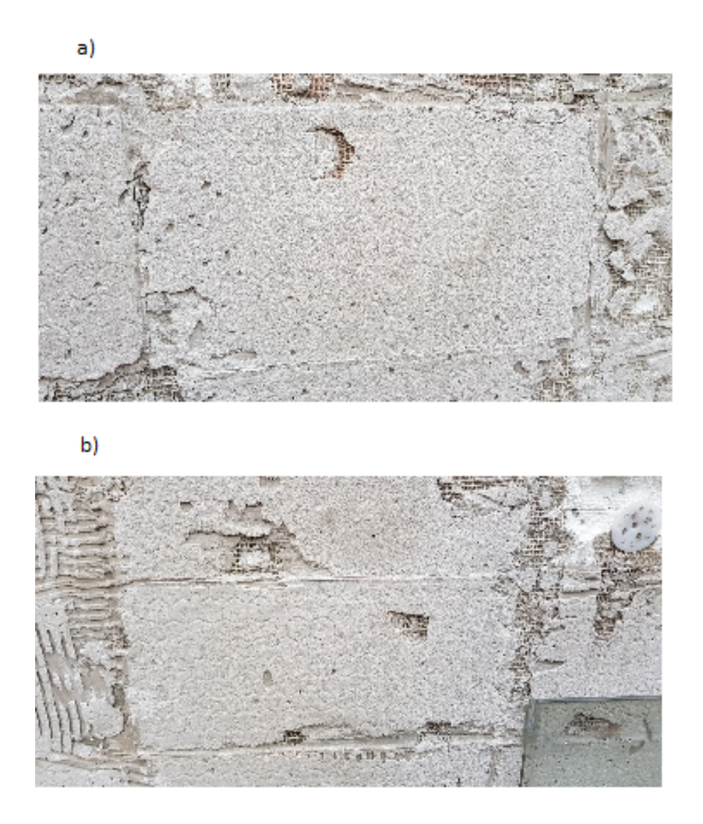
Figure 3. Mechanism a), b) (method of detaching) the ceramic cladding of the building facade