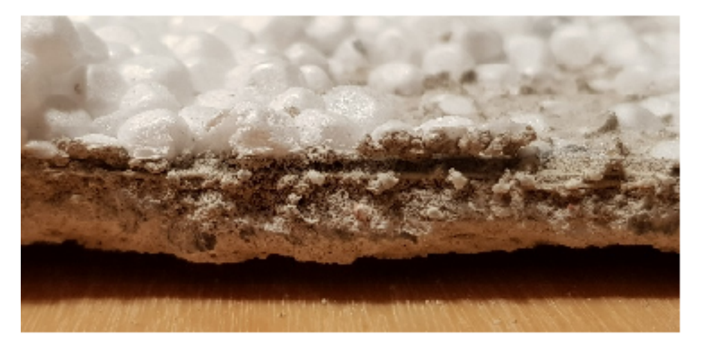
Figure 2. Details of thermal insulation (substrate) a), b) and c) for the ceramic cladding of the building facade