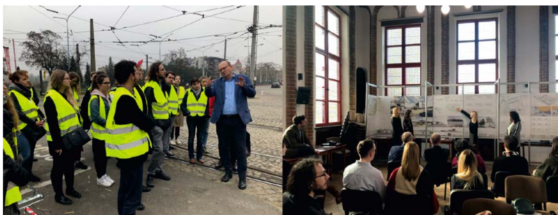
Figure 2: Field trip, studies, research and discussions conducted within the studies on architecture design for Master's students in the academic year 2019/2020.

Another element was the organisation of classes in the form of a competition. In creative endeavours, competition has a positive effect on students' creativity.