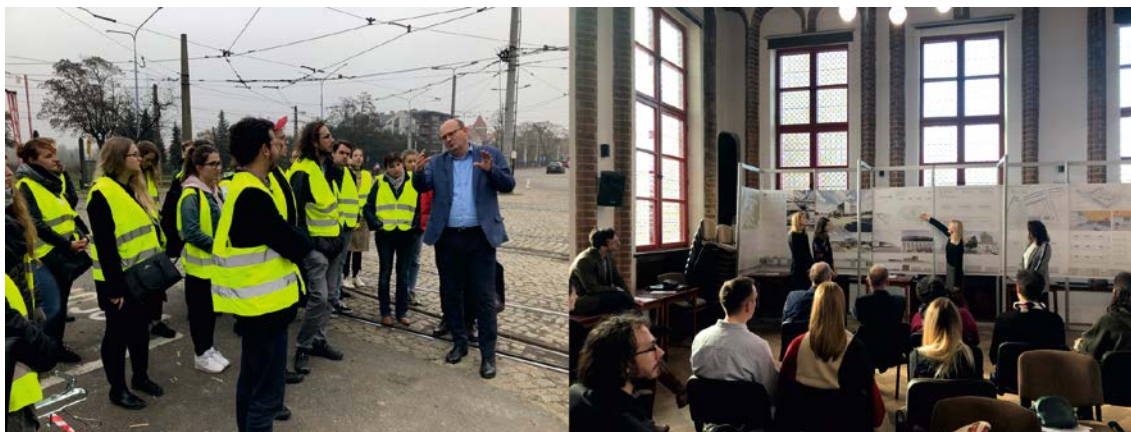
Figure 2: Field trip, studies, research and discussions conducted within the studies on architecture design for Master's students in the academic year 2019/2020.

Another element was the organisation of classes in the form of a competition. In creative endeavours, competition has a positive effect on students' creativity.