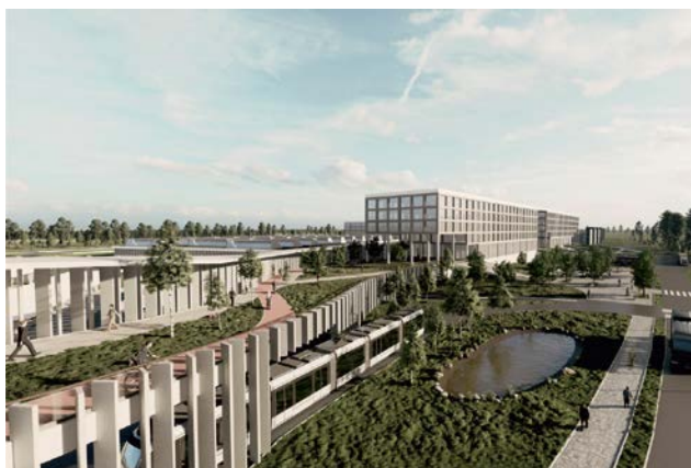
Figure 4: Final project proposal 2 (Student group: P. Hejden, K. Moczyński, P. Rojewski).