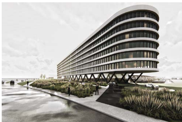
Figure 3: Final project proposal 1 (Student group: A. Roguszewska, S. Sitniewska, P. Stępińska, M. Cymanowski).

The projects were significantly varied in approaches (see Figure 3 and Figure 4), and addressed problems initially not indicated in the project brief. For example, some of the design solutions were specifically oriented towards solving ecological problems of facilities of the type, such as water and energy management. Another solution incorporated social functions into the project; for example, a kindergarten for employees' children, community centres, as well as social gardens and workers' canteens.