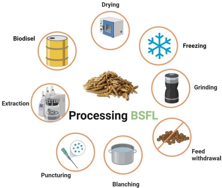
Fig. 3 Applications and technologies in the processing of BSFL (created with Biorender.com)

similar, the digestibility of the protein was significantly higher (exceeding 75%), when the larvae were subjected to oven drying as opposed to microwave drying.