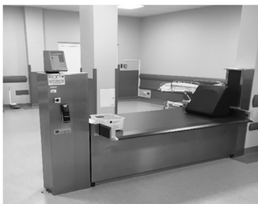
Figure 3. Mechanical equipment supporting patient transfer

The third model assumes the use of mobile operating table slabs. A stable column is permanently installed in the operating room. A slab is placed on top of it, which is transported in together with a patient on the transport cart. This facilitates transport within the operating block and the weight of the transport unit is reduced compared to the second model by the weight of the operating column. In order to eliminate manual patient transfers in the operating block it is possible to use mechanical equipment supporting patient transfer. (Figure 3) A huge aid in this procedure is the use of a stationary transfer unit which enables the transfer of a patient within the hospital. The use of such a device must, however, be planned at the early stage of planning the operating block. This is a result of equipment installation and spatial requirements.