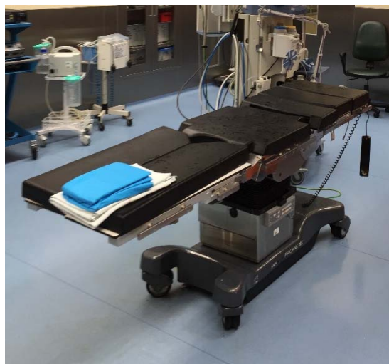
Figure 2. Mobile operating table

The first model discussed deals with the largest number of patient transfers carried out by the medical personnel. Entry of a hospital bed into the operating block area is impossible due to the risk of transferring pathogens from the hospital environment to the area subject to the highest level of epidemiological protection. The adoption of restrictions to the entry of external means of transport to the operating block results in the necessity of patient transfer. The patient is transferred in an airlock onto a means of transport functioning within the operating block. Further transfers are generated by the immobile operating table type and the location of the recovery room. This transport model is presented in figure no. 4.