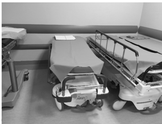
Figure 1. Patient transport carts

The first model discussed deals with the largest number of patient transfers carried out by the medical personnel. Entry of a hospital bed into the operating block area is impossible due to the risk of transferring pathogens from the hospital environment to the area subject to the highest level of epidemiological protection. The adoption of restrictions to the entry of external means of transport to the operating block results in the necessity of patient transfer. The patient is transferred in an airlock onto a means of transport functioning within the operating block. Further transfers are generated by the immobile operating table type and the location of the recovery room. This transport model is presented in figure no. 4.