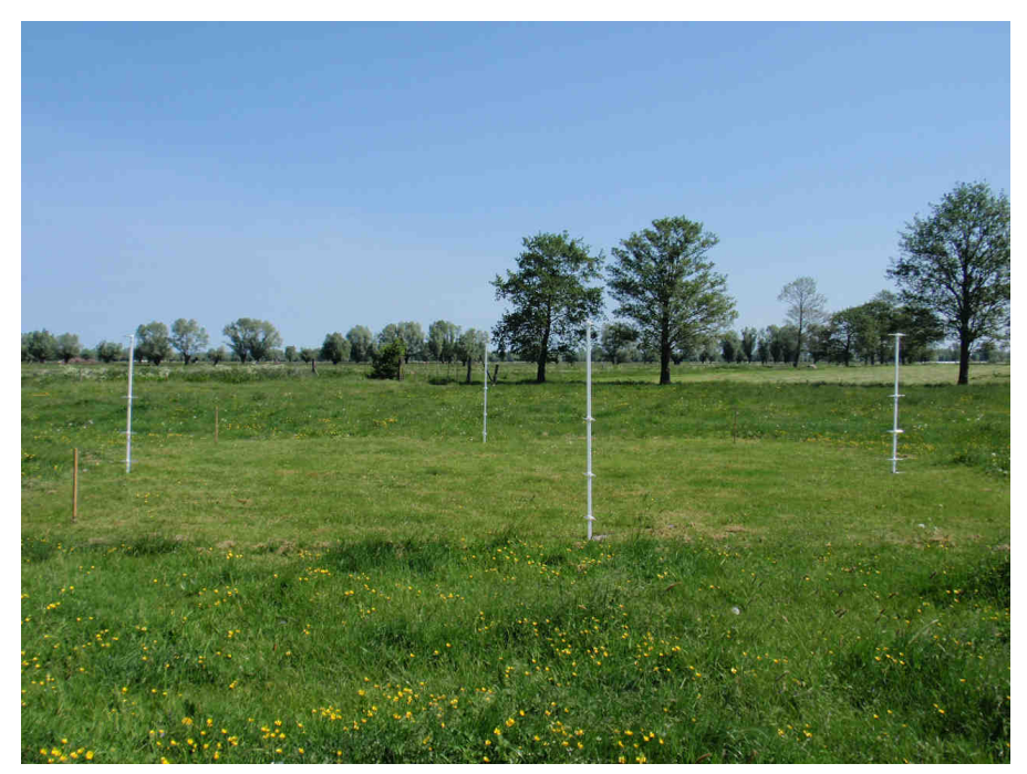
Fig. 2. Field measurement of ammonia emission on the experimental plot

nitrogen dose of 60 kg N/ha after cutting and removing the grass. Each plot received only one type of fertilizer. In the case of farms A and C, moNolit46 and ammonium nitrate were used (Table 1), while moNolit46 and urea were applied on farm B. Field experiments were conducted from 30 May until 17 June 2011. A 4-day measuring cycle was used on the farms A and B, and a 5-day measuring cycle on farm C. Agrotechnical and meteorological observations were conducted to complement the measurements of ammonia emission. The influence of moNolit46 on the yield and quality of the produced biomass has not been assessed during field experimentation.