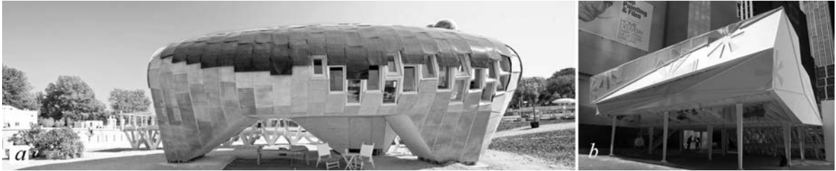
Fig. 2. (a) The Solar House, IAAC, 2012; (b) System BURST*008, Gauthier D., J. Edmiston, 2008.

The form of The Solar House also results from parametric design strategy in which “form follows energy”. The shape of the house resembles a three legged headless body of an animal covered with scales made of solar panels. (Fig. 2a) [10]