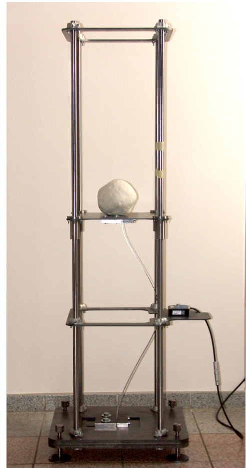
Fig. 1 Setup of the experiment.

Therefore, the aim of the present paper is to investigate experimentally the dynamic buckling behaviour of columns under bending (observed during the earthquake) that are additionally subjected to an axial plastic impact load. Steel columns with high slenderness ratio were considered in the study. In the experiment, impact load was created by a weight that was dropped onto the top of the column and stayed on it after collision so as to simulate the real situation, which takes place during the earthquake.