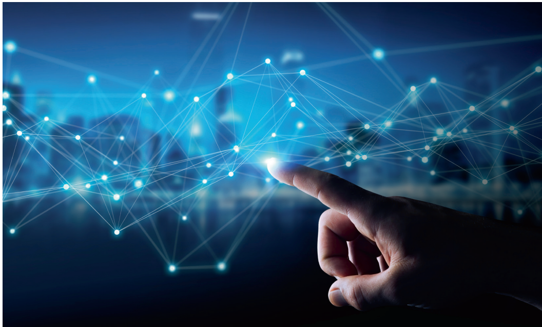
Figure 1 The desire to research exists in all of us and the ingenious spark of creativity driving that desire is ignited simply by paying attention, asking the right questions and connecting the dots – all of which can lead us on the right path.