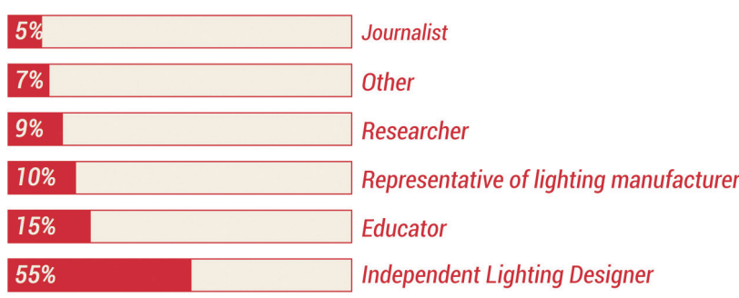
Figure 2 Survey participants – an overview of the professions involved.