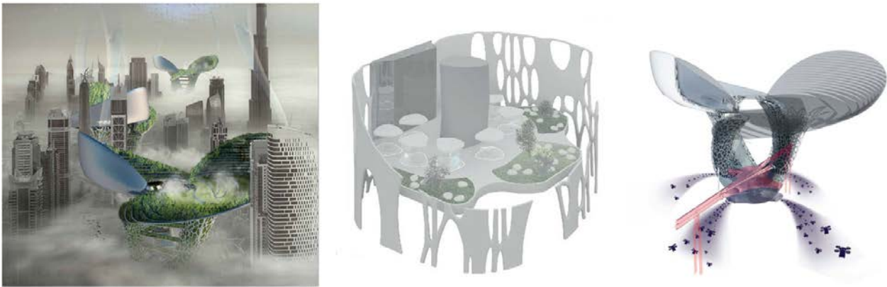
Figure 2: Flying Tomorrow . Created by: Jakub Sokólski and Łukasz Staniewski, Faculty of Architecture, Gdańsk Tech.

The surge toward a return to nature, blurring the boundaries between the architectural object and the environment, between the built and the organic appeared as the most explored path toward the architecture of the future. To develop such scenarios students planned for the new means of transportation, such as transportation drones or a hyperloop (high-speed transportation), used materials with a negative angle of reflection making the surfaces invisible, materials that change colours to provide energy benefits or organic materials, such as algae for the production of biomass (Figure 2 and Figure 3). Instead of increasing carbon emissions - buildings were designed as microclimate installations that bring benefits to the environment. Green buildings were presented as covered with layers of vegetation and equipped with vertical living walls inspected by automated horticulture robots. Floating objects were conceptualised as growing structures fabricated from filaments made of micro plastic extracted from oceans by controlled strains of bacteria.