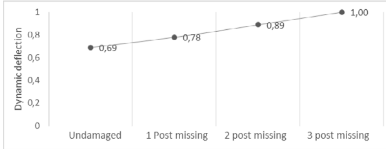
Fig. 1. Simulation results of the barrier crash where the post links into the guardrail.

One of the tests analysed the effects of a missing or damaged post on barrier performance upon a crash. To that end a simulation was conducted using the finite element method in the programme LS-DYNA. The simulation was validated based on available literature data from previous crash tests. The simulation was designed to test how many posts can be removed while still keeping the operational performance of the barrier. The simulations were conducted for 1, 2 and 3 missing posts (Fig. 1) with the crashes conducted at two points: at the beginning of an unsupported span and mid-span where the missing post should be.