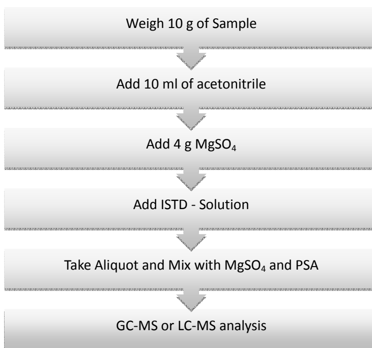
Figure 3. Steps in the QuEChERS procedure of sample preparation for the determination of pesticide residue in fruit and vegetables.

The consumption of sample and toxic solvents with the QuEChERS method is minimal. By applying QuEChERS to the determination of pesticides in fruit and vegetables, matrix effects are eliminated and high recoveries of target analytes are possible. The method can be modified depending on the type of sample and the target analytes. To improve the extraction of polar organophosphorus pesticides, the method is modified by the addition of acetic acid. When samples of citrus fruit are under investigation, protective wax coatings can be removed by freezing the samples for at least one hour. For samples, with a high content of carotenoides or chlorophyll, cleanup with PSA is not satisfying and there is a need to use GCB which is best in handling and effect. QuEChERS approach takes advantages of the wide analytical scope and high degree of selectivity and sensitivity provided by gas and liquid chromatography (GC and LC) coupled to mass spectrometry (MS) for detection. QuEChERS is a multi-residue method with fast sample preparation and low solvent consumption [73–79].