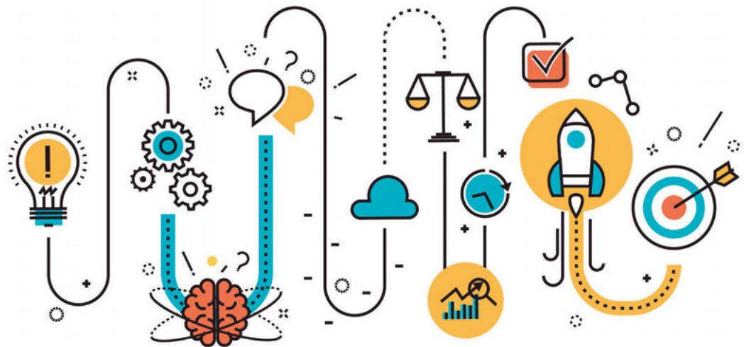
Figure 2 The above diagram indicates the potential complexity of artificial light on humans, involving many interconnected factors that create a cascade effect.

To further complicate matters, lighting practitioners, responsible for designing artificial lighting are overwhelmed with recently developed metrics such as: circadian action factor, melanopic sensitivity, melatonin suppression index, circadian light, etc., and they need clear guidance on which ones to use and why (see Fig.2). In Europe numerous associations with various task groups including SLL, CIBSE, and CIE are working around the clock on appropriate guidelines and standards; and overseas, IES is doing the same. But without proper, repeated long-term research involving humans of different ages, sex and sensitivity towards LED artificial lighting, all the proposed metrics might be just guesswork.