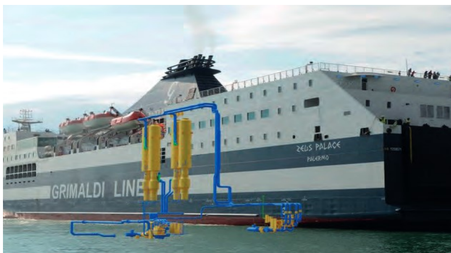
Fig. 2. Visualisation of the scope of a complex multidisciplinary exhaust gas modification for a Ro-Pax vessel

diverse and changing requirements must be met efficiently and effectively [23]. The expected improvements might be a good justification for investments and the implementation of new solutions, and the solution selection process is an interesting subject in itself [24]. Current global trends in design and engineering companies lead to the conclusion that an increase in the subsidiary processes in the organisation and IT tool integration should lead to an increase in efficiency and collaboration; digitalisation is an obvious next step for the construction and shipbuilding industry [20]. As the implementation of the core business-related building information modelling (BIM) software generates the majority of profits for the end customer, the construction company [25], the management personnel of the independent design and engineering companies strive to cut the costs and time consumed by their own work [26]. Fig. 2 shows a visualisation of the complex multidisciplinary scope of the Ro-Pax vessel exhaust gas system developed by one of the Wayman users using the BIM software.