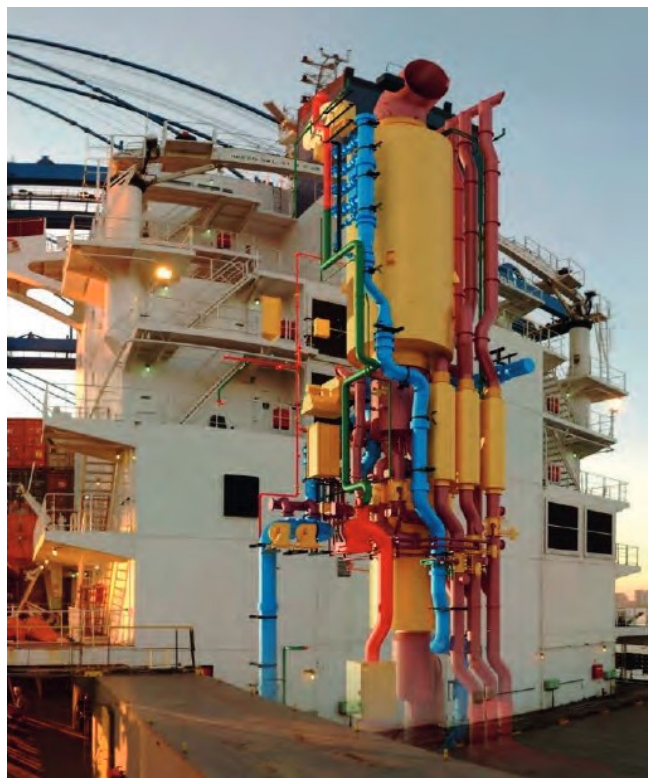
Fig. 1. Visualisation of the BIM model of the exhaust gas system of the cargo vessel

The conducted review of scholarly publications revealed a lack of studies specifically targeting human resource management processes in marine design firms; however, a prevalent recommendation among researchers in the domain of project portfolio management and its human resource management sub-process is to conduct inquiries within distinct engineering sectors, thereby catalysing research endeavours within the marine design firm sector. A good example of both multidisciplinary and diversified engineering activity is the ship design sector. Based on the matrix organisation structure, design and engineering companies are simultaneously performing several projects, facing a large number of changes [16]. In these circumstances, design and engineering resource management becomes a crucial foundation of competitiveness and the key to business and technical success [17]. High-level digitisation results in an increase in the design process' economic efficiency by improving internal procedures and eliminating manual activities [18]. The implementation of available software solutions allows the top management of engineering design companies to focus on the decision-making process [19]. In Fig. 1, a graphical representation of the scope of the multidisciplinary exhaust gas system conversion project developed by one of the Wayman software users is shown.