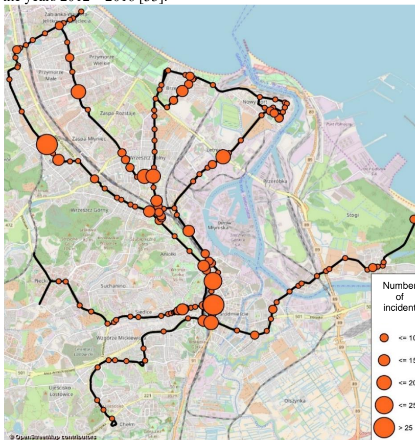
Figure 3. Location of tram incidents 2012-2016 [33]

crashes, followed by hitting a pedestrian and hitting a preceding vehicle. Car drivers are clearly at fault in most collisions with as much as 77% of the cases attributed to drivers. Other road users are responsible for a similar number of incidents: pedestrians – 6%, tram driver – 9%, other – 7%. One percent of all incidents is caused by passengers. Figure 3 shows the location of road accidents on the tram network in the years 2012 – 2016 [33].