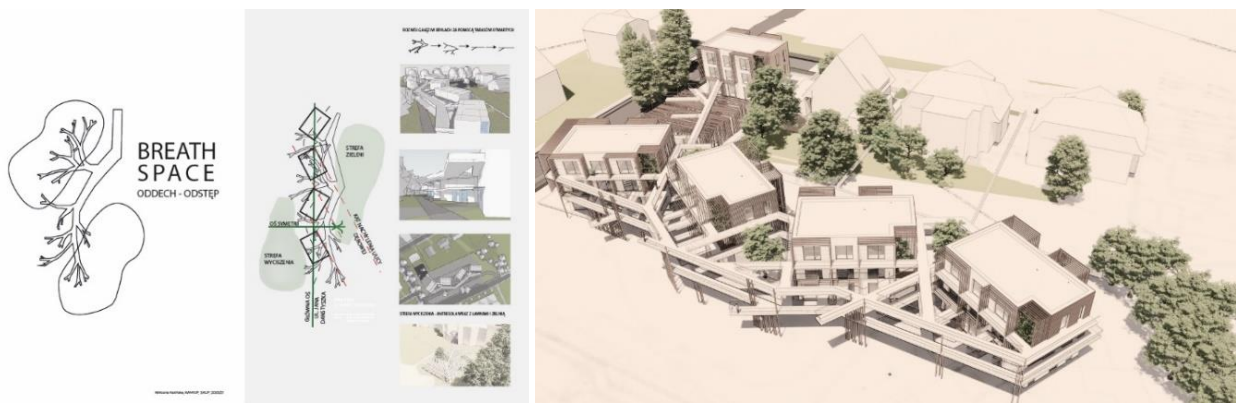
a) b) Figure 1: The design process and idea in the context of the pandemic time (student: Wiktoria Kalińska).

In the FITA method, predesign is the very creative phase of the design process because it is the time for the descriptive formulation of the idea, illustrating it by an ideogram and creating several variants of the abstract dimensional forms to fulfil the criterion of flexibility (Table 2, PD.1, PD.2, PD.3). An example of developing an idea derived from the pandemic time is presented in Figure 1 and Figure 2. The idea to create a breathing space was developed in the external structure of balconies connecting separate segments of a dormitory, which resembled the vessels of the lung or a tree branch.