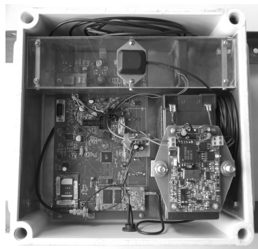
Fig. 2. Mobile monitoring unit prototype.

The first version of the measurement device was equipped with a factory-made module with sensors, A/C converters and a microcontroller to convert the sensor's electric response to gas concentrations. This module was connected to a communication unit which aggregated measurement results with geographic coordinates from GPS and sent these data to a server using a GSM/GPRS link. Positive test results and the confirmed usefulness of the proposed device encouraged the authors to build the next generation of a monitoring station based on a set of sensors described in Section 2. The interior of one of the monitoring unit prototypes built in a Gdansk University of Technology laboratory is shown in Fig. 2.