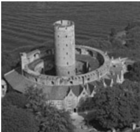
Figure 1. The Vistula Mounting Fortress

The following values of the errors were obtained for the tower's natural frequencies \varepsilon[f_1^{N-S}] = 0.00322 , \varepsilon[f_1^{E-W}] = 0.00337 , \varepsilon[f_i] = 0.00689 and \varepsilon[f_2^{E-W}] = 0.00871 . The error for all the modes is the same and amounts to \varepsilon[\phi] = \varepsilon_r[\phi] = 0.177 , because \varepsilon_b[\phi] is negligibly small as it is of the 0.001 order (see also [3]).