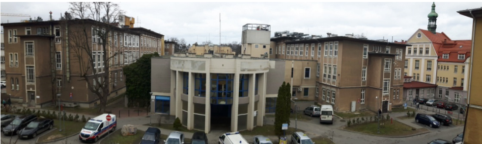
Figure 3: Hospital of Gdansk Medical University from the beginning of the 20 th century, with pavilion layout. The building of cardiovascular surgery unit with operating theatre, built during modernisation in the 1990s, is visible between historic pavilions. Modernisation and extension design by arch. A. Kohnke.

A design for hospital modernisation requires from its authors more knowledge and experience than in the situation when a hospital is designed from scratch. In the case of modernisation an architect, apart from the knowledge necessary to design health care facilities, must possess the skill to make compromise decisions, as modernisation often involves conditions and limitations which are difficult to reconcile. In modernisation of historic hospitals there is an additional difficulty, namely the necessity to design in compliance with monument-protection requirements, ensuring that historic buildings will be preserved in the state as unaltered as possible. In the case of hospitals, i.e. buildings with complex functional layout and the highest degree of technological saturation, it is a very