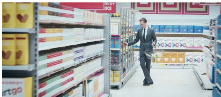
Figure 1: A still from the movie, High-Rise (2016), directed by Ben Wheatley (Digital edition: P. Czyż).

A very telling example is the relationship between everyday life and the surroundings. In the case of modernism, the movie, High-Rise (Figure 1), a film adaptation of J.G. Ballard's novel, points to the mall as an icon of modern life [2].