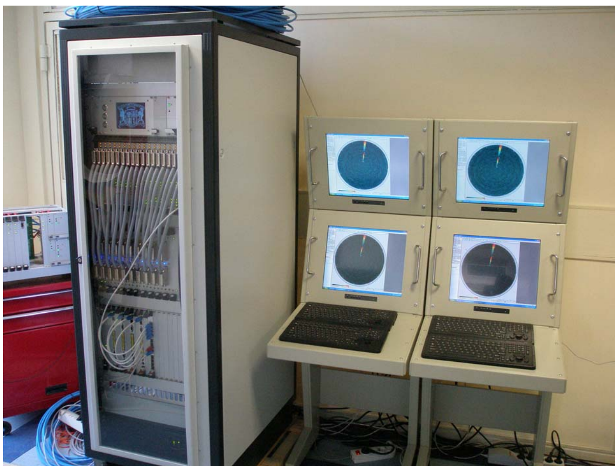
Fig.2. The Digital Signal Processing Unit and Operator Consoles of the modernized ASW sonar SQS-56 during the laboratory testing