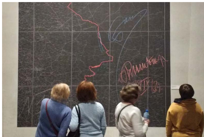
Figure 7. Visitors looking at the map showing the delimitation of the interests of the USSR and III Reich on the territory of the Second Polish Republic from 28.09.1939

emotions from visitors and at the same time, are a testament to those past times. It's also thanks to them, that the museum attracts so many visitors.