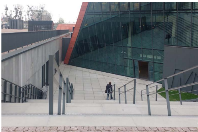
Figure 5. The main entrance located 4.5 m below the ground level to introduce visitors to the atmosphere of the presented exhibition

In the original design, the building solid, which is located above the terrain level - a tower in shape of leaning prism with triangular base and height of about 40,5 m in the highest points [19], was supposed to be finished with architectural concrete. However, due to unfavourable climatic conditions, designers decided to use prefabricated, dyed in mass concrete slabs, 1.2x3 m in size. Brick coloring of the façade was used intentionally - the designers cared to refer to the character of the former city of Gdańsk and the once predominant red brick buildings. The above-ground part, despite its proportionally small share in the usable area, has become (due to its height) a dominant feature, a landmark in the landscape surrounding its space and a new symbol of Gdańsk [20]. In this section, among others, a library, lecture, conference rooms and a cinema can be found. The highest level has a cafe and a restaurant overlooking the panorama of Gdańsk.