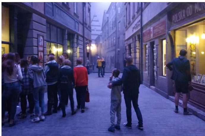
Figure 2. A pavement of Grossegasse street from before World War II used as a part of the exhibition