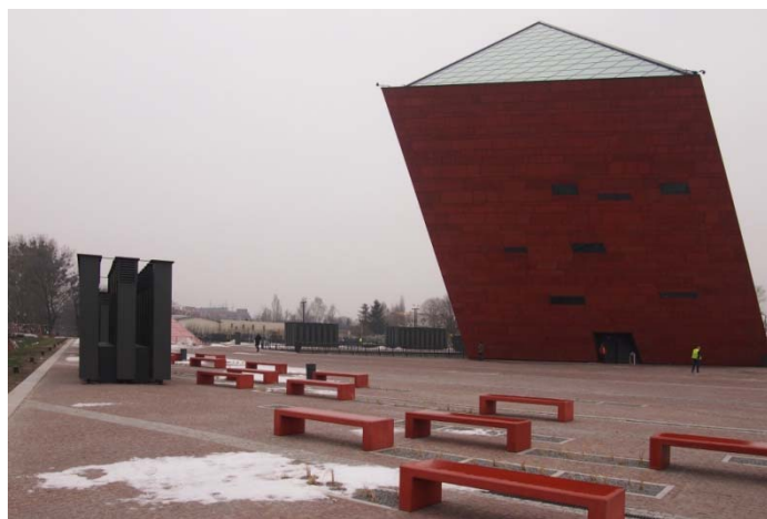
Figure 4. The area around the building – before final changes were made

In the first version of the land development project, the area around the building was only to be lined with granite cubes. There were no elements of small architecture or greenery designed for the place. Due to changes in the construction project involving the removal of ventilation canals from the underground part of the building, successive changes were made to the land development project. Finally, due to the appearance of mechanical ventilation and air intake and an issue of a considerable heating of the square, the authors proposed additional space for the tree pots and a lawn of 600 m 2 .