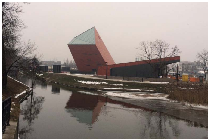
Figure 6. View from the other side of the river to the Museum of the Second World War

The functional solutions proposed in the architectural project were meant to symbolically connect the past, the present, and the future. Each of these elements was reflected in the individual parts of the building. The area symbolizing the past is below the ground, the present is represented by the square around the building, and the future is reflected in the aboveground part of the structure.