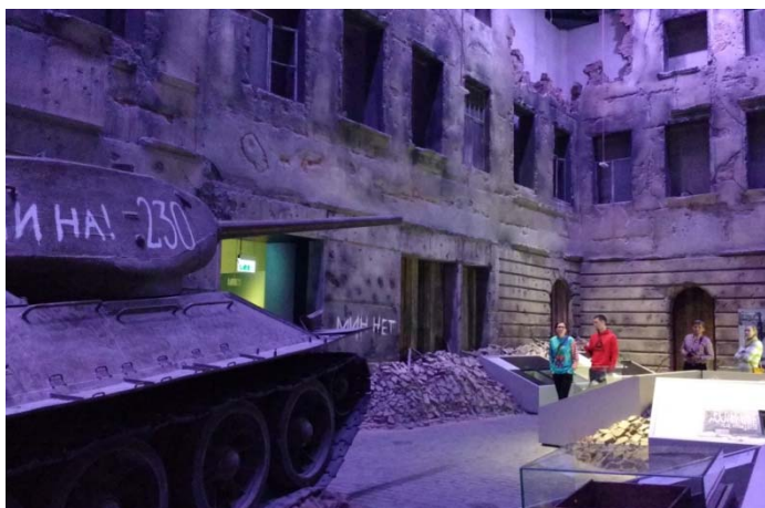
Figure 3. Visitors watching the exhibited tank, installed before the completion of structure

During the construction work, even before creating ceilings it was necessary to already place the largest exhibitions inside (like a tank) and building maintenance equipment (i.e. ventilation unit) in the underground part intended for the main exposure.