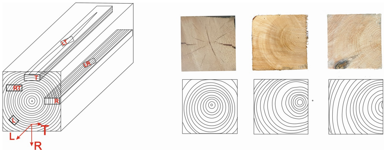
Figure 2. Wood anatomic axis and wood fracture systems: longitudinal (L), radial (R), and tangential (T) directions (a). Wooden beams with the variable location of the cross-section core (b).

The following relationships between the components of the state of deformation and stress can be written in the LRT coordinate system: