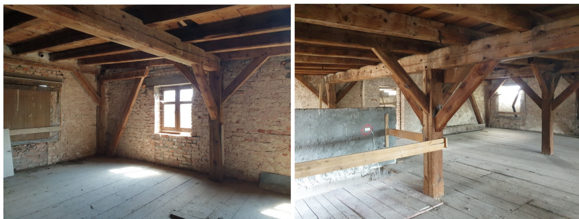
Figure 1. Example of the use of wood in the construction of a ceiling.

Inevitable wood defects such as cracks or knots are another complication. Two models of anisotropy can be used to describe the elastic properties of wood: transverse-isotropic or orthotropic. The first one is described by five independent elasticity constants, while the second one by nine. For comparison, the isotropic body model, which is used to describe most building materials, is characterised by only two elastic constants. The orthotropic body model is a more accurate model for describing the properties of wood.