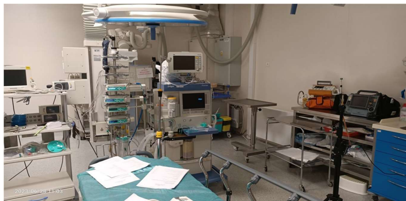
Fig 1. Placement of the probe in the procedure room of a clinical emergency department

Medical phrases from various fields such as oncology, pathomorphology, radiology, the emergency room, and surgical procedures, were recorded. In addition to medical phrases, our data set also includes information on drugs and their intake. An illustrative depiction of the acquisition process during surgery is provided in Figure 1, featuring the use of a sonic probe.