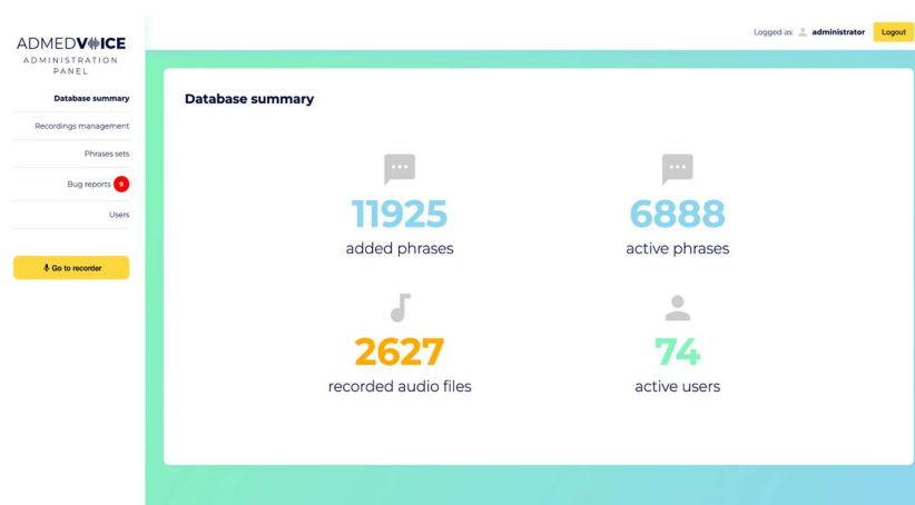
Fig 2. Server repository for data acquisition

Furthermore, experts across various medical disciplines actively contribute by adding recordings and their corresponding transcriptions to our server shown in Figure 2. Recognizing the inherent challenges of gathering data in dynamic environments like emergency rooms and during surgical procedures, we have innovated a state-of-the-art sonic probe. It was developed at the Multimedia Systems Department at the University of Technology, enables selective and directional gathering in noisy environment. The schematic diagram of our 6-channel acoustical probe is presented in Figure 3 below.