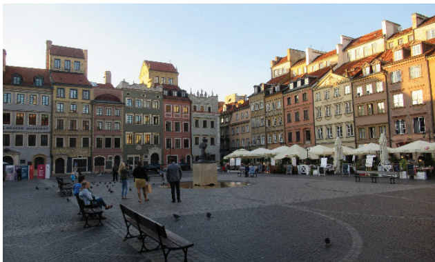
(a) Warszawa: Old Town Market

Although, paradoxically, this specific concept of post-war reconstruction—defined as a means of restoration of the centre of national identity, the Old Town of the Polish capital—was also used to recreate the centres of former German cities such as Wrocław (Czerner, 1976; Małachowicz, 1985) and many others, including Gdańsk (Massalski & Stankiewicz, 1969; Stankiewicz & Szermer, 1959; Szermer, 1971; Figure 2), it was applied to very