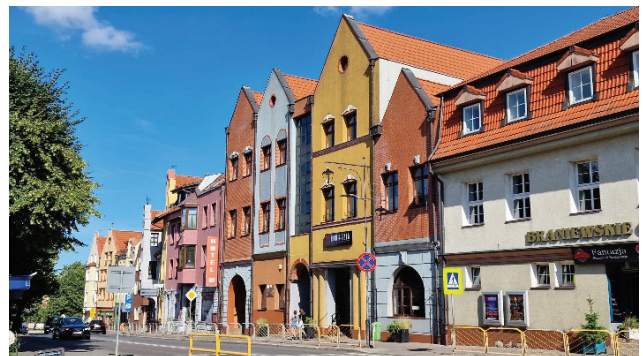
(d) Braniewo: New complex in the vicinity of the Cathedral Church