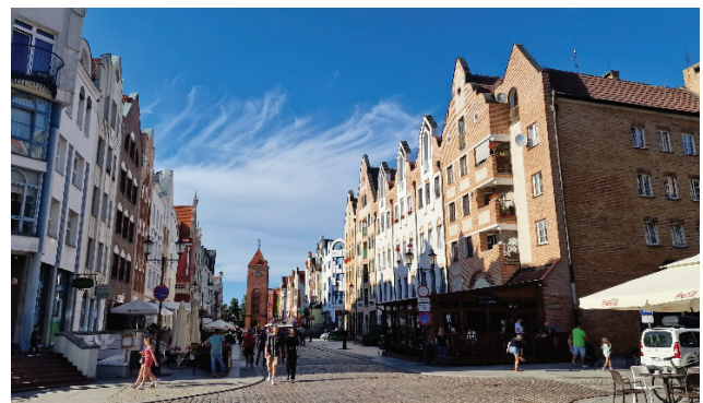
(b) Elbląg: Stary Rynek Street