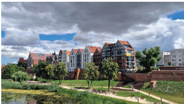
(c) Malbork: New complex in the forefront of the Old Town