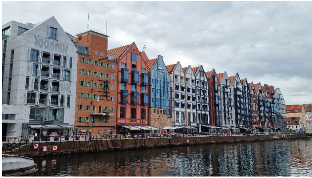
(a) Gdańsk: Granary Island